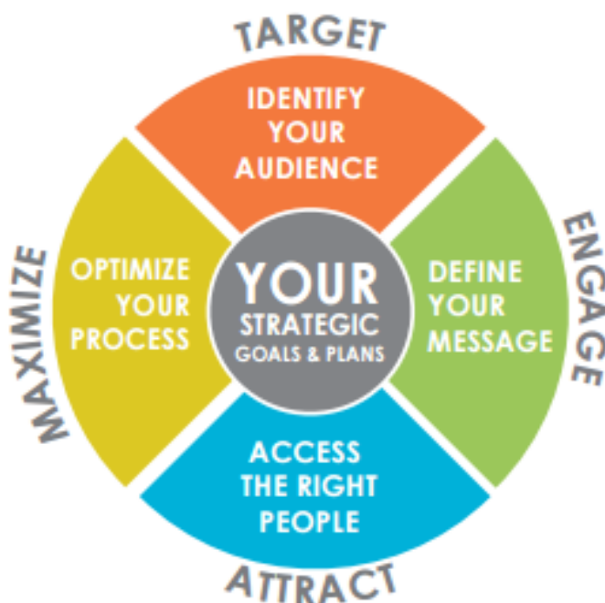
Figure 1. The T-E-A-M philosophy of recruitment (Gaspary 2010, 3)

For developing the online recruitment process for Cinnabon in Finland, I have found and researched the recruitment guide created by a popular employment platform Career-Builder: it describes the T-E-A-M philosophy of recruitment (Target – Engage – Attract – Maximize). In short, it starts with identifying the demographics for recruitment, then defining/strengthening the employment message, spreading the message and approaching candidates, and finally assessing the results to improve the process further. All of those are connected to and answer the strategic goals and plans the company wishes to achieve in the future. (Gaspary 2010, 3) Personally, I believe that as a framework it offers great value in its detailed approach to the stages of recruitment process, because it considers current trends of recruitment and can be tailored to take advantage of different methods and tactics of online recruitment. It covers such topics as utilizing company culture and employer brand as valid engagement tools during recruitment process, and strengthening them in return via broader exposure to candidates who are attracted by it. Another example would be trending emphasis on social media aspects of recruitment – an element that can easily be incorporated within this framework (Stewart 2015). All of the above makes this framework versatile, modern, and comprehensive.