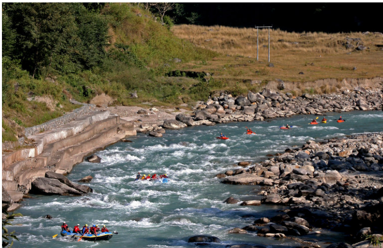
GRAPH 6. Canoeing

Canoeing in an unexplored white water of Nepal is a different feeling and a great achievement. Wild rivers in Himalaya of Nepal is an adventure sport that involves traveling down creeks or streams within a canyon by a variety of means including hiking, scrambling, wading, boulder hopping, rock climbing, abseiling and rappelling using safe techniques. As many true adventure seekers have discovered, the most exciting spot for swimming begins at the very edge of a 45m waterfall. At the end of the excursion, the last jump submerges participants into a pool. (Himalayan Humanity 2008.)