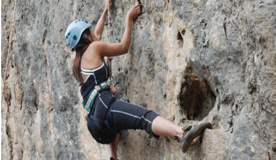
GRAPH 7. Rock climbing

In Pokhara, an artificial climbing wall named after the French alpinist Maurice Herzog, the first mountaineer ever to summit an 8,000 m peak – Annapurna I – in 1950, is open at the Mountaineering Museum. It is 23 meters tall. (Himalayan Humanity 2008.)