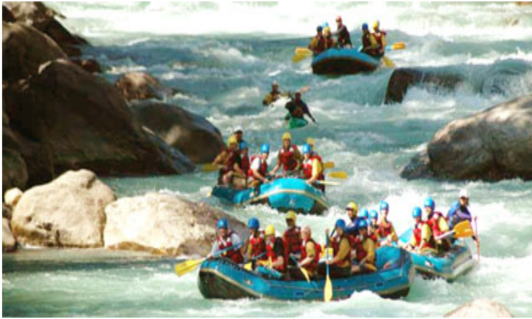
GRAPH 4. White water rafting