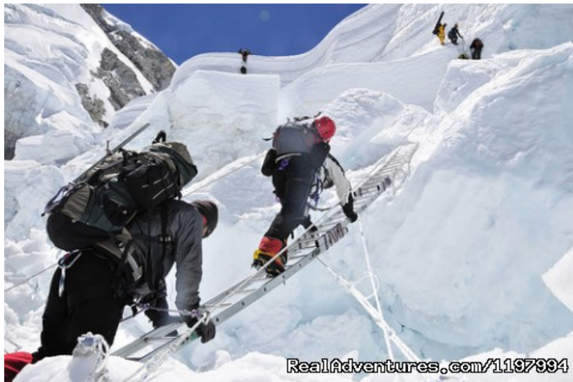
GRAPH 1. Mountaineering