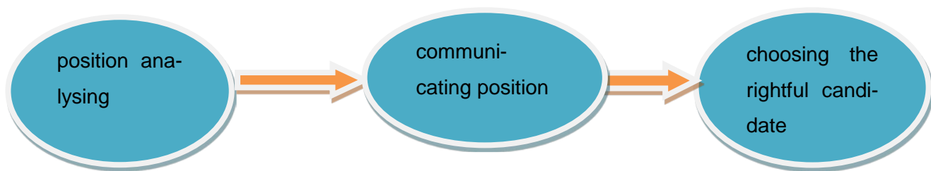
Figure 2.recruitment procedure (see chapter 6.2)

tion, the goals of the recruitment and job descriptions are been taken into consideration during this process to ensure success in other words design jobs with recruitment in mind. It is important to build in attractive features of the job this however helps in retention and most importantly provide key information that can be used in recruiting messages (Nikolaou & Oostrom 2015, 17), for instance our pay is the highest in the industry .The job candidates on his/her part finds out all the available and necessary information about the company, areas available on different channels and media during the job hunting process