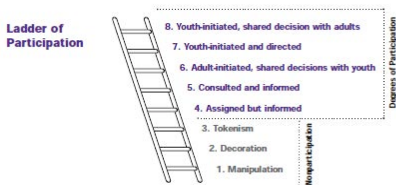
Fig. 4 Ladder of youth participation

The level of youth participation will rely on Roger Hart’s ladder of participation (Fig. 4).