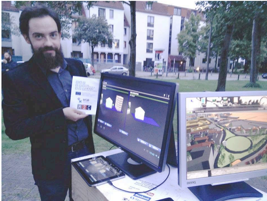
Fig 5. Sternenklause event in Bremen, Sept. 2015

Although the technology still lacks precision in positioning 3D models in the augmented view of the mobile device, it creates high interest (yes – we are still working on the positioning problem in another project) and fosters discussions on functional demands in the restructured area, as figured out in the section above.