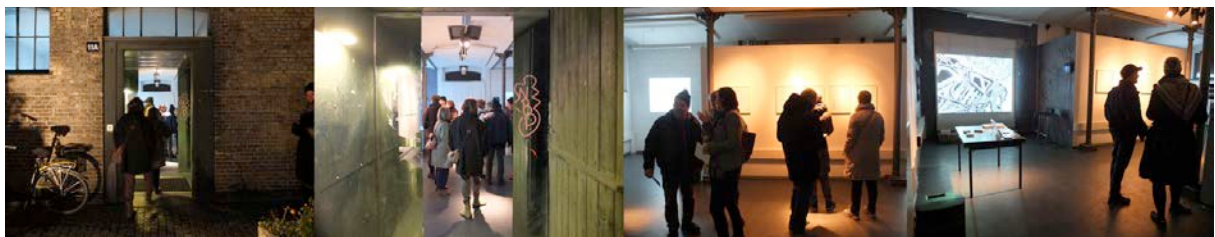
Fig. 2: Warehouse 9 meet the guides, Copenhagen, October 2015

In the City of Abadyl and now the project “Journey to Abadyl” we have developed several methods and processes for participation both in the early stages of concept development and in the mapping the activities and the people of Kødbyen in central Copenhagen. The most central method here is called Fieldasy[1] and started to evolve in 2003-2004, first presented as an exhibition in Malmö, Sweden at the Gallery Skanes Konst. Later as a research paper for the Pixel Raiders conference at Sheffield-Hallam University in 2004. With Fieldasy we tried to unify different methods into one creative process that attempts to understand and redefine our world in a situation where information is lacking. This lack of information is used as a resource, for example by providing ambiguous fragments as a starting point, removing constraints on the imagination. It was designed with respect to staging a conflict that has a mind triggering influence on the participants/co-creator with a set of problems that only can be captured in a given material.