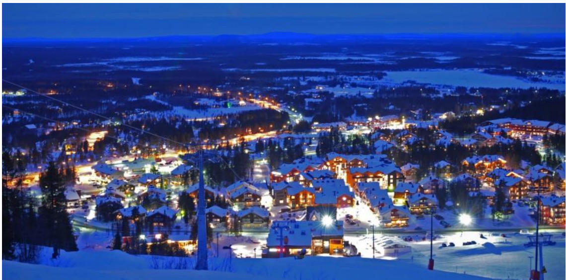
Figure 5 Scenery from Levi Ski Resort's central town

As in the years preceding the games new infrastructure will be constructed in the three competition sites of Beijing, Yanqing and Zhangjiakou, the demand for skilled personnel will most definitely witness a rising trend. Newly constructed venues, hotels, resorts and other facilities require educated and properly trained staff, not to mention properly educated managerial professionals to run them profitably and efficiently.