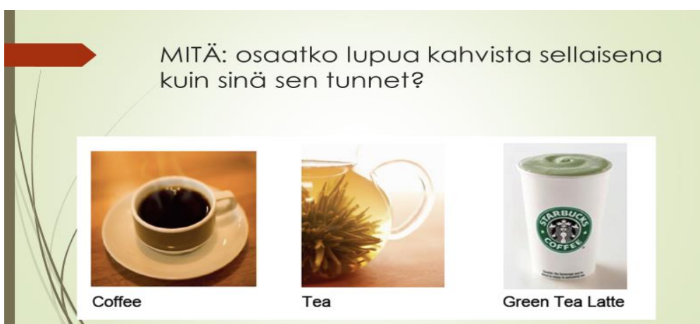
Figure 8 Can you give up coffee the way you know it?" (A. Lammassaari, n.d.)

The previously introduced concept of Cultural Intelligence appears to be too superficial and vague in its approach and does not provide any in depth guidance and does not promote the real impact that can be achieved if interpreted only as a behavioral approach. Culture Business Intelligence™, introduced by Annamari Lammassaari in 2008, is a concept which begins by defining (1) the business goal of the enterprise, and the corporate vision for the achievable milestones and benchmarks for success during the company's long term commitment to business in China. By repositioning (2) the solutions, product and service offering for the customer and consumer needs in China, determined by Chinese stakeholders and their perceptions of how they want their product, companies have in their hands the keys to potential success in the region. This concept can be simplified in one picture representing the Chinese hybrid of Coffee and Green Tea. Figure 3 below represents an example of successful product repositioning as a means of catering to Chinese tastes. (A. Lammassaari, personal communication, October 2016)