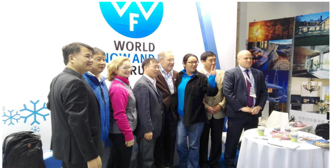
Figure 3 Members and partners of the WSIF organisation at the WSIF booth at WWSE 2016

Objectives in these key areas will be reached by facilitating and embracing good and friendly business practices between Finnish and Chinese organisations and enterprises by bringing them together under the umbrella of WSIF and guiding them through agreements, negotiations and the various phases of cooperation. The organisation also works to lessen the burden of cultural differences by bringing the parties involved together, building strong professional relationships of trust and friendship.