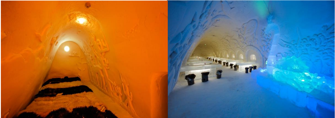
Figure 6 Examples of the audio-visual presentation of LumiLinna SnowCastle. (Laapotti, n.d.)

With modern refrigeration technology, similar presentations can be constructed and displayed regardless of location and local temperature – in a somewhat smaller scale of course. Nevertheless, the effect of such visual experiences on the passer-by is far greater than that of promoters working with a simple stand, supported by plastic or wooden decorations. Design approaches like this could also be used at the various events included in the winter games; at races, indoor areas, activity areas among some examples of the possible uses of such knowledge and design. It goes without saying that it is hard to achieve a true, magical winter atmosphere without the genuine elements.