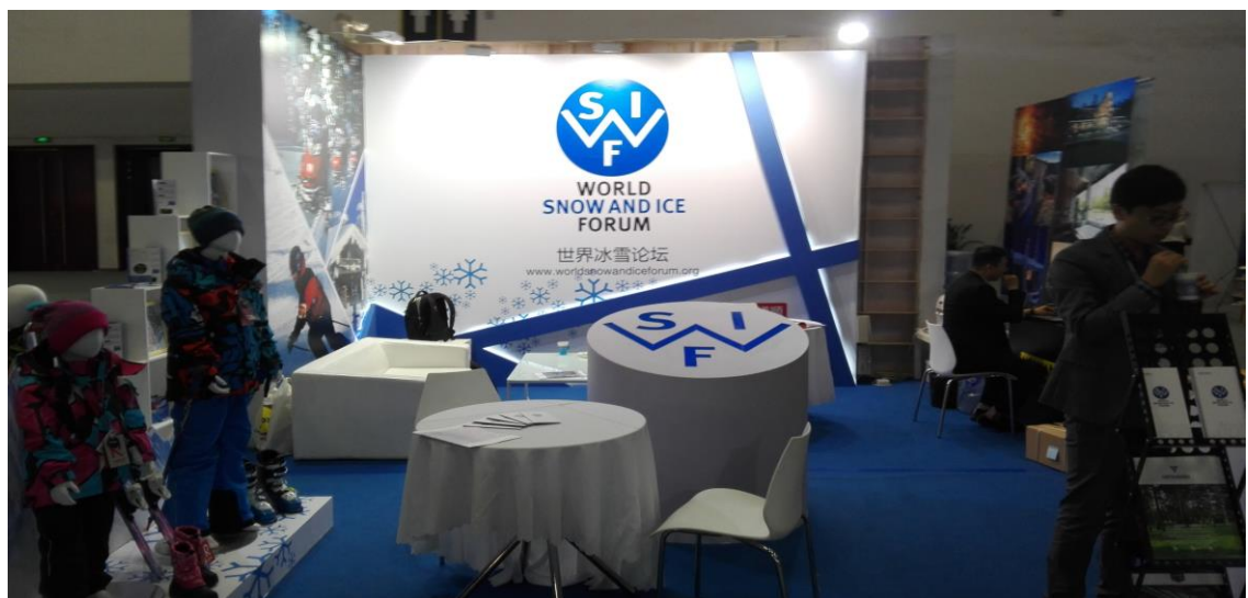
Figure 4 WSIF booth at World Winter Sports (Beijing) Expo.

The organisation made its first major, large-scale public appearance at the first annual World Winter Sports (Beijing) Expo, held 19 th -22 nd October at the China National Convention Center in Beijing, China. In addition to forum speeches and keynotes by organisation members, WSIF also appeared at the expo with a booth of its own, in which a variety of Finnish winter culture and winter sports enterprises were represented.