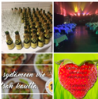
Figure 3: My own collage made of the recently posted pictures

A. With the permission from Mrs Laine, I randomly chose hotel's Facebook profile pictures to create a collage in order to demonstrate how some of the images look now: