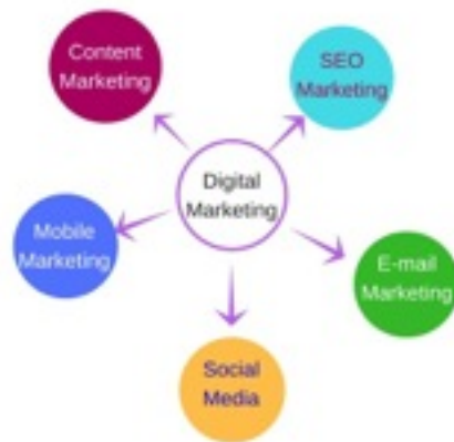
Figure 1: Digital Marketing channels

Digital marketing channels are the tools that a company will use in order to share information and promote the products. Nowadays there are several channels that a company may choose in order to reach its target audience. Here is Figure 1 representing the most modern digital marketing channels, according to S. Jacob (Jacob 20 January 2017.)