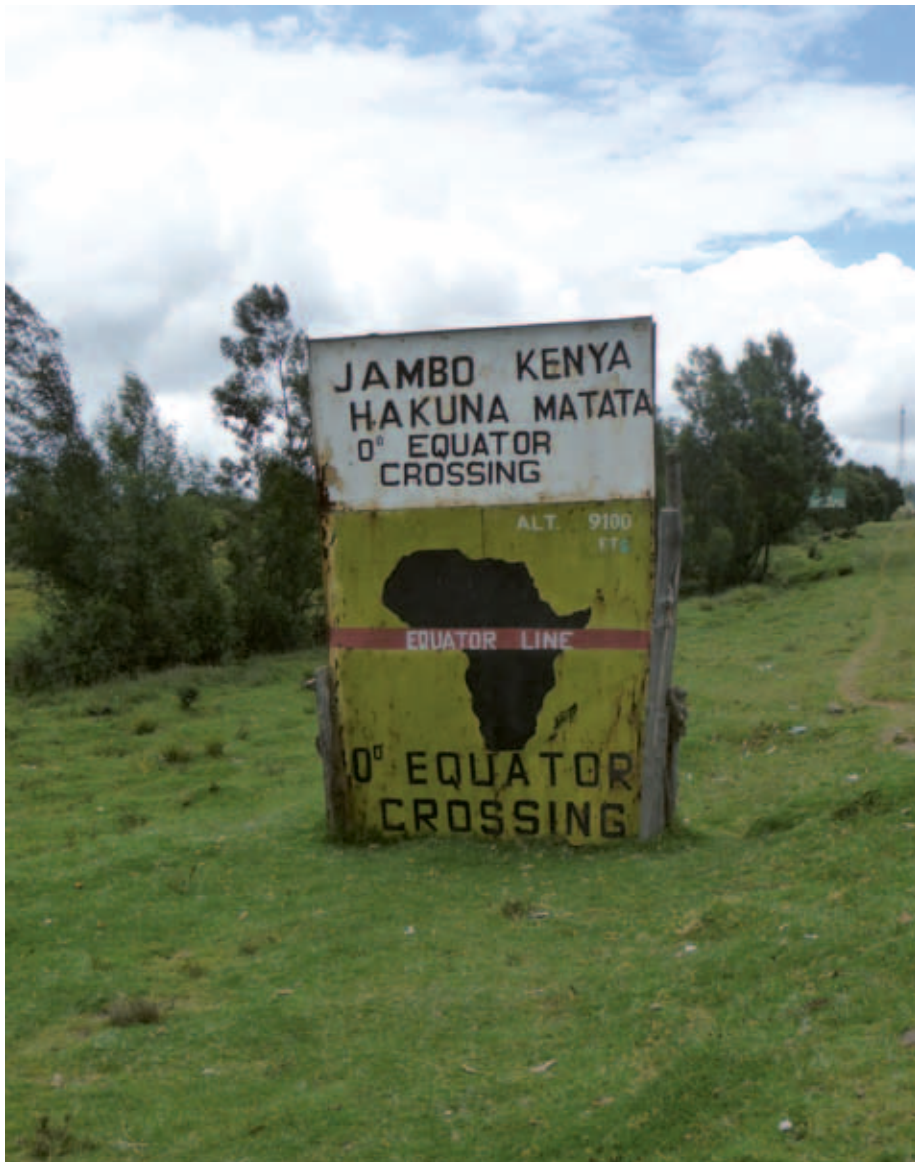
Picture 2. On their way to the UEAB workshop, the participants needed to cross the Equator.

The workshop programs, the program of the international seminar and other documentation are provided as attachments (Annexes 4 and 5).