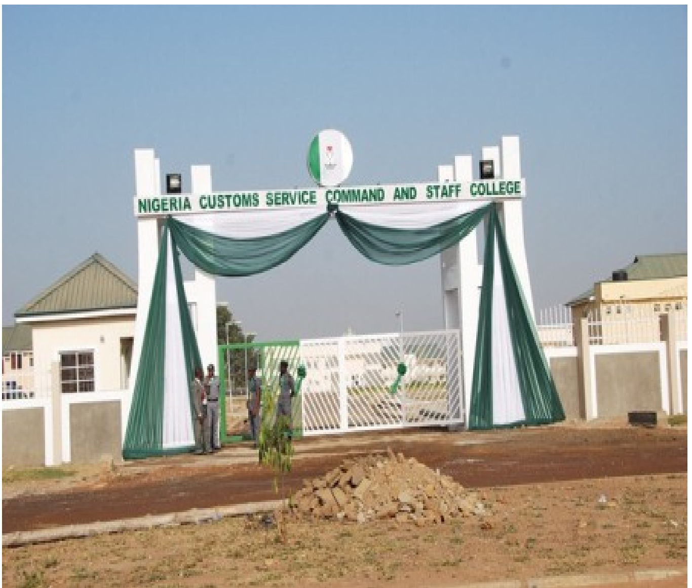
FIGURE 2. NCS Command and Staff College.

measures are potential of automation, tracking, monitoring and recovering lost revenues, Nigeria customs promote officers and men of the services strictly based on merit not on related forms and deliberate stakeholder's engagement across the country. In addition to this, ant-smuggling crusade make a huge success, the agency work tirelessly and recorded over 4,000 assorted seizure worth over 11 billion naira in value, the seizures according to NSC include 2,671 pump action rifles, dangerous drugs, foreign band rice, and smuggle vehicles among other. Even some gallant officers lose their lives in the line of duties. (Punch Newspaper 2017, 32-33.)