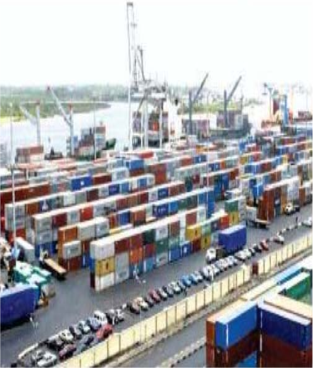
FIGURE 4. Cargo cranes at the Apapa port, Lagos Nigeria. (Adapted from Annual Customs report 2016.)