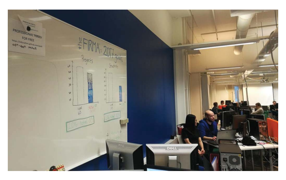
Figure 2. Students working in theFIRMA's office. TheFIRMA's brand color is blue, which inspired the students to brighten up the office by painting one wall blue.

close to each other. Students are responsible for the layout, so they can adjust it as they see best fit.