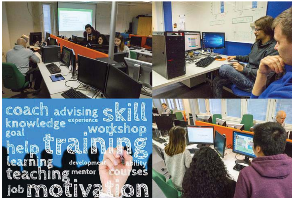
Figure 1. All of the FIRMA projects are done in groups where senior-level students mentor the junior level students.

The FIRMA participates in several externally funded R&D projects, where the focus is, for example, on digitalization of SMEs and digitalization of circular economy. The “Hot Potato” project implements 50 customer pilots with Finnish SMEs and based on the experience gained in the pilots, creates guidelines for the companies interested in digitalization, gamification and knowledge management. Pilots are focused on rapid experimenting in companies that are eager to develop their performance further, increase productivity and enhance well-being at work. Pilots are done in co-operation with 50 Finnish SMEs, TUAS and University of Turku. The project is funded by partner universities, companies and European Social Fund. (Säisä et al., 2017). The main goal of the rapid experiments in “Hot Potato” is to try something new with the customer company, and if the experiment seems fit well for its purposes, then it can be adopted into companies processes. On the other hand, if the experiment reveals that it does not fit the company’s business nor processes, it can be quickly abandoned and changed to a new rapid experiment. In some cases, instead on long-lasting planning phase, it is just good to try new process, new prototype or new service and see how it fits. The scrum methodology suits well with rapid experiment projects.