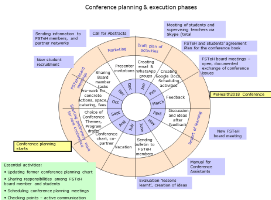
Figure 1. Conference planning and execution phases.

taken into account when planning conference programme. In order to organize well-working conference it is based on effective and active multimodal communication throughout the process of conference-project.