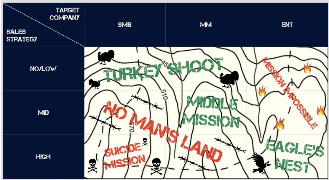
Figure 2. SaaS Mission Matrix (Ford, E. Advanced B2B, 2018).

The model depicts Small to Medium Sized Businesses (SMB's), Mid-Market and Enterprise firms as target companies along the horizontal axis, and matches the sales strategy with the vendor's No or Low touch, Mid touch and High touch sales resources on the vertical axis (Advanced B2B, 2018).