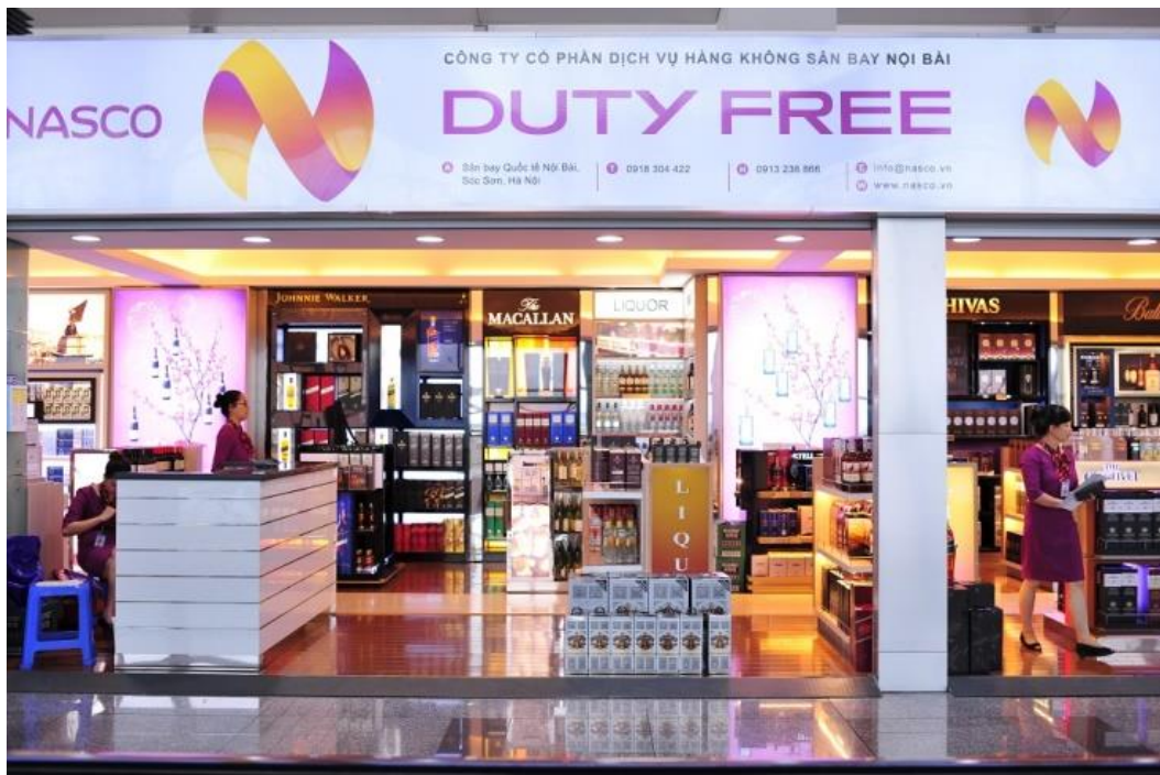
Picture 1. Duty Free Shop at Noi Bai International Airport

mands, the country needs to speed up and strengthen the circulation of goods and services. Foreign trade is an essential element to satisfy this requirement. To maximize the profit from foreign trade, Vietnam needs to focus not only on enhancing the effectiveness, but also diversifying the forms and models of the operation activities of foreign trade. Duty-free business appearance in Vietnam is one proof of this diversification.