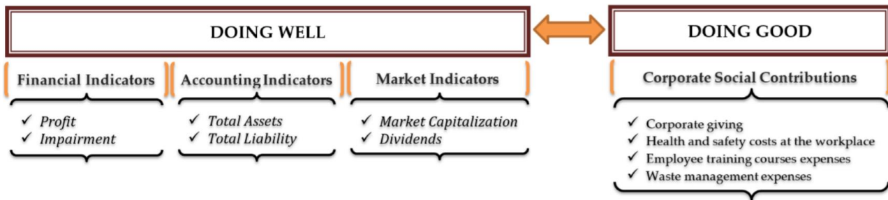
FIGURE 2. Doing well and Doing Good indicators (adapted from Hategan, Sirghi, Curea-Pitorac & Hategan 2018, 10)