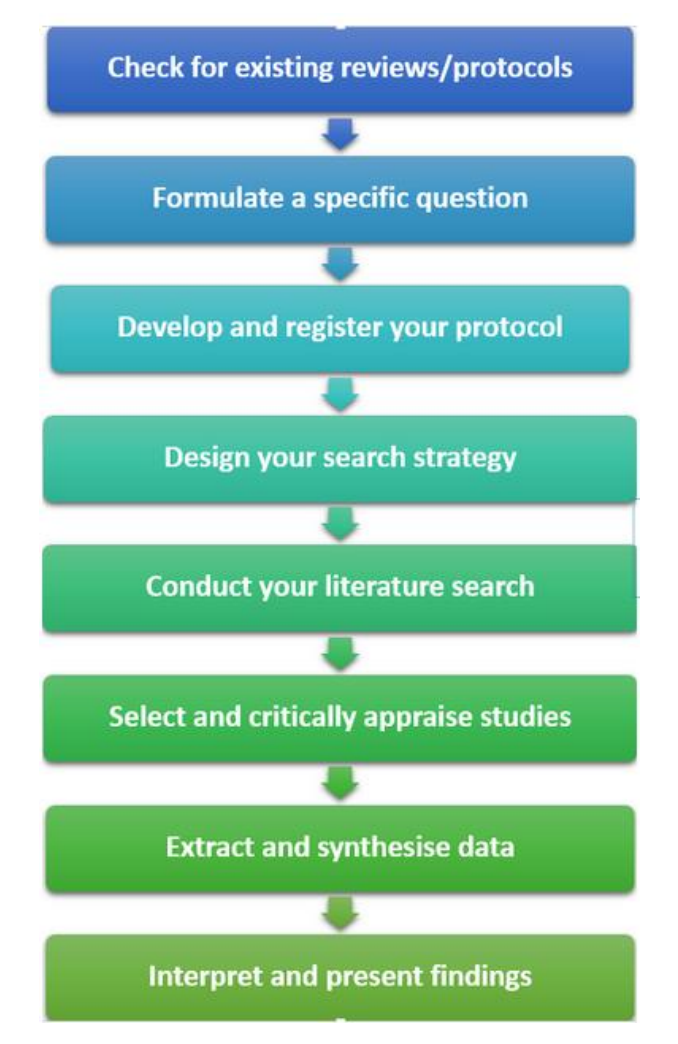
Figure 1: Steps in a systematic review (Website of Curtin University 2019)