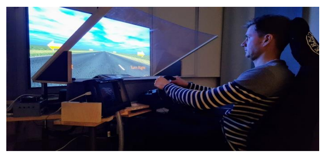
from the pre-recorded LCT video session to the LCT simulator software. The driver was instructed to press the accelerator pedal so that the vehicle was moving once the user took control over the driving.

As it is not possible to simulate autonomous driving mode in the LCT software, our setup utilized pre-recorded sessions to achieve this. The sessions were timeline marked, which meant that it was possible to navigate to any specific section of the recording to match the user's position on the track. As illustrated by Fig. 3, after HO request the user display input was switched to the pre-recorded driving session video, specifically to the exact section of the track corresponding to the current user lane position on the LCT software. The switching was done using a Roland V-1HD device, which seamlessly transitioned from source 'A' (LCT simulator) to source 'B' (pre-recorded LCT video session). Although the switcher was capable of automatic trigger-switching using the serial port input, manual transition was preferred to ensure completely seamless transition. Take-over transitions were done in a similar manner. Once the user confirmed the TO request by pressing the relevant button on the steering wheel, the Roland V-1HD device was used to switch the display input