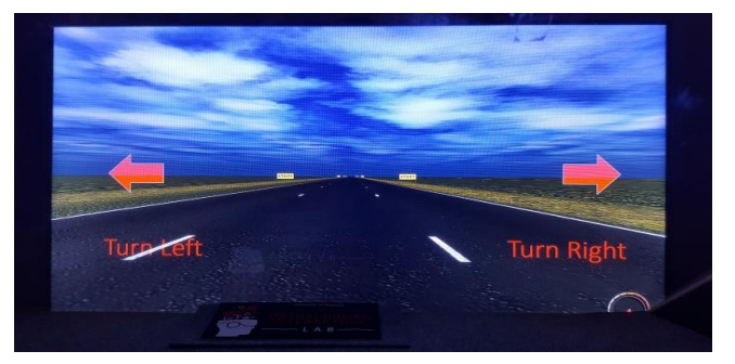
Fig. 3. The driving setup (top) and LCT simulator with overlaid turn instructions (bottom).

One of the conditions in the experiment was to have the user perform a specific task after TO request. As the LCT simulation software does not have supporting mode, we utilized input merging as well as switching options on the Roland V-1HD device. To achieve this, we used a third PC input with "turn left" and "turn right" markers and merged this input with the LCT simulator visual input (Fig. 3). This meant that the user display would have the LCT simulator input overlaid with either the "turn left" or the "turn right"