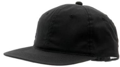
Dad Cap Black 149 kr