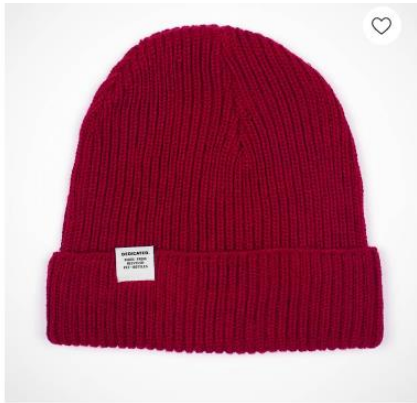
Beanie Lofoten Burgundy 27.95 EUR