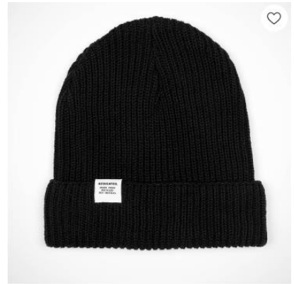
Beanie Lofoten Black 27.95 EUR