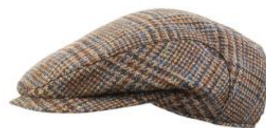
IVY SLIM CAP