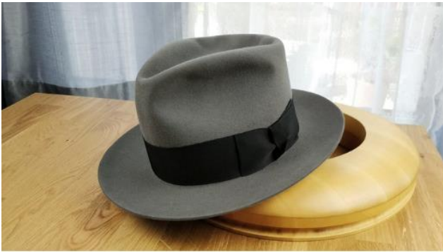
RAGNAR FEDORA from $250.00