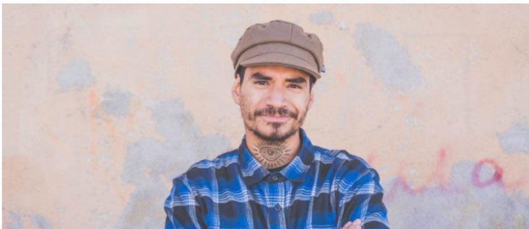
Picture 1 Example of Tella headwear (Tella Oy 2019).