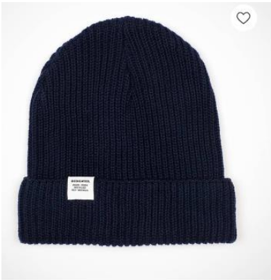
Beanie Lofoten Navy 27.95 EUR