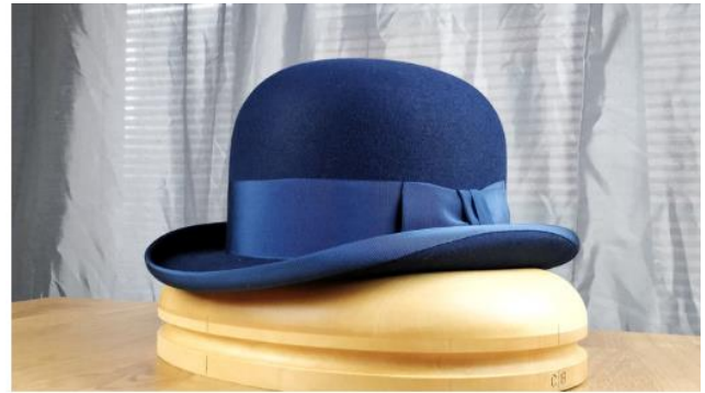
HJALMAR BOWLER | 30X Beaver Blend $335.00