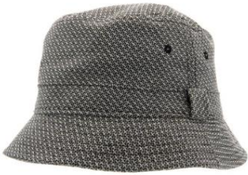
ili Sr. Floro Black 99 kr