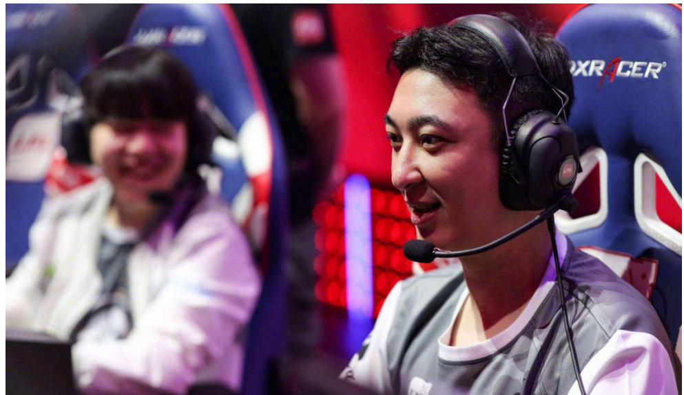
Figure 4. Wang Sicong, who participated in the LPL professional competition as an IG player ( https://chejiahao.autohome.com.cn/info/2911948 ).

The e-sports club is an important department for selecting and training e-sports players. Each e-sports club can have multiple teams participating in different projects. There are two types of e-sports clubs: 1. The e-sports club is formed by the investors. For example, Wang Sicong sets up the iG club and became a teammate, Lin Junjie sets up the SMG club, etc. 2, The professional players spontaneously form the e-sports club, for example, 17shou (Wang Kang) formed 17 teams. Former professional player BurNing (Xu Zhilei) formed the Team Aster Stars team. The development of e-sports clubs with investors is relatively stable, and the investment of e-sports clubs requires a lot of money. The spontaneous formation of the players usually require many times to become a professional team or to form an e-sports club. The e-sports club is an institution based on the professional team, equipped with complete facilities for the players to train and professional instructors, and for the purpose of the competition bonus. The performance of the e-sports club affects the financial support provided by the investor. A good e-sports club has sufficient funds and training facilities. (Figure 4)