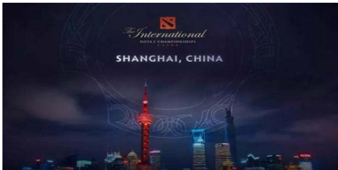
Figure 3. Ti9 Shanghai held promotional photos ( https://www.deal-moon.com/cn/breaking-news-nintendo-switch-patch/1437914.html )