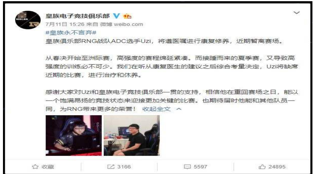
Figure 5. The e-sports player Uzi was injured.