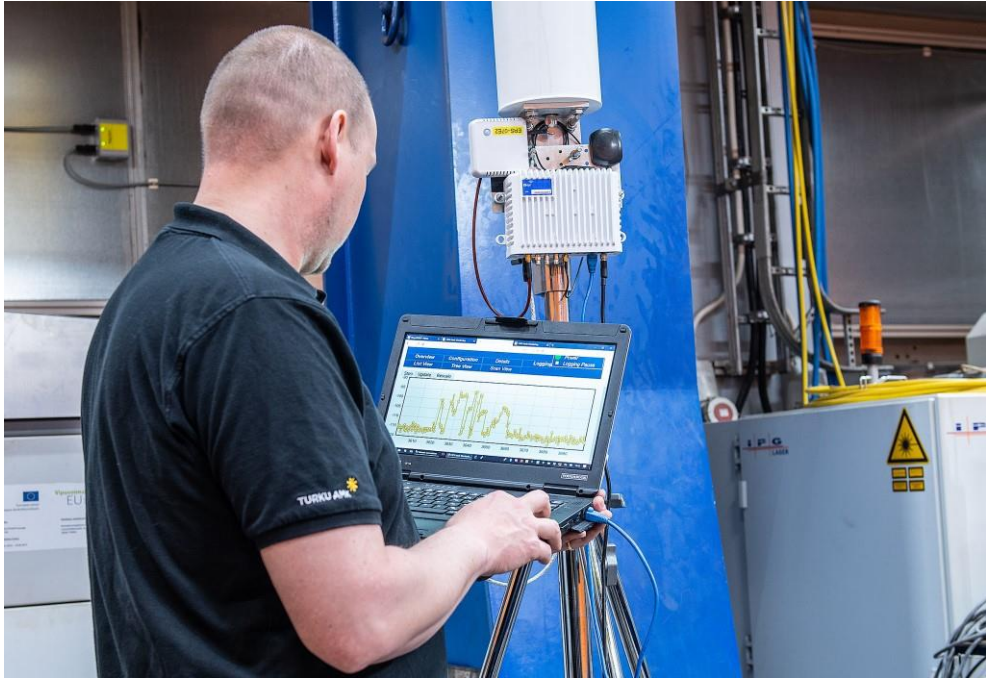
Figure 1. The CRFS RFeye spectrum measurement equipment.

After assessing spectrum availability, a private network operating on 3.5 GHz frequency was installed inside the TUAS #factory environment and network coverage measurements were conducted. Sufficient coverage and capacity for this environment were achieved with two low power base stations.