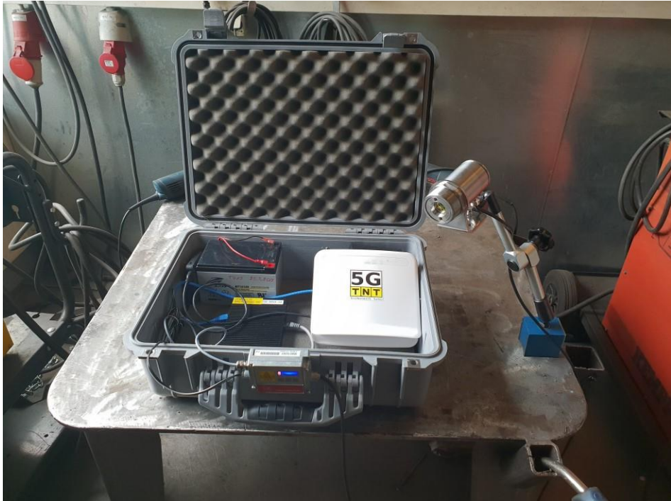
Figure 2. Wireless pyrometer setup.

In this paper, a wireless communication system was built into a commercially available pyrometer. The system is based on a cellular network technology. The built portable installation with its battery installed inside a case is shown in Figure 2. The pyrometer is installed into the metallic arm on the right side of the case. This allows measuring the cooling time of the weld at critical locations with easily portable equipment. The measured temperature data is stored locally in the memory associated with the sensor, from which it is wirelessly transferred into the cloud. The 3.5 GHz private network installed into the factory was successfully used for data transfer. The T8/5 value is calculated from the data at the visualization and reporting stage and stored with a time stamp. The goal is to store the T8/5 value of each piece later into the PLM system. Figure 3 shows the arm and the pyrometer system installed to monitor a welding robot.