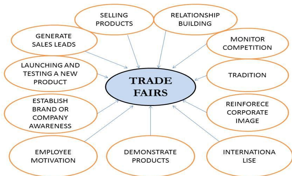
Figure 3. Marketing communications objectives and trade fair participation (Geuens & van der Bergh & de Pelsmacker 2007, 505)

Exhibitions are the ideal place to launch and test new products and to see “live” the impact of the product in the visitors: if they like it, reject it, ask for more information, give an opinion on how to improve it etc. Figure 3 shows that trade fairs can be a good place for new and old companies to increase brand and company awareness by offering some products to visitors, giving prizes etc. Products can be demonstrated in fairs and the visitors, as stated before can test it. This is a good way for the visitor to check the real value of the product and feel it: the visitor can touch, smell, taste, see and hear the product; visitor’s 5 senses play a big role in exhibitions. Company’s corporate image plays a big role in exhibitions; companies attend exhibitions not only for a question of marketing but also for a question of image and branding. If a big exhibition is celebrated and all the competitors are present but the company is not, the competitor can easily attract the customer. Companies can also go international by attending foreign exhibitions and also that will lead to keep increase their corporate image. Finally, trade fairs and exhibitions can be a good way to motivate company’s employees by organizing them VIP arrangements and inviting them to parties and luxury hotels (Geuens & van der Bergh & de Pelsmacker 2007, 505).