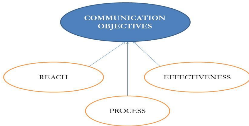
Figure 2. Categories of communication objectives (Geuens & van der Bergh & de Pelsmacker 2007, 164)