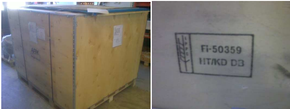
Figure 5: The plywood box and the stamp on the box

(KTTK). AFM has the certificate to show that “the packaging material used is free of all kind of insect damages”.