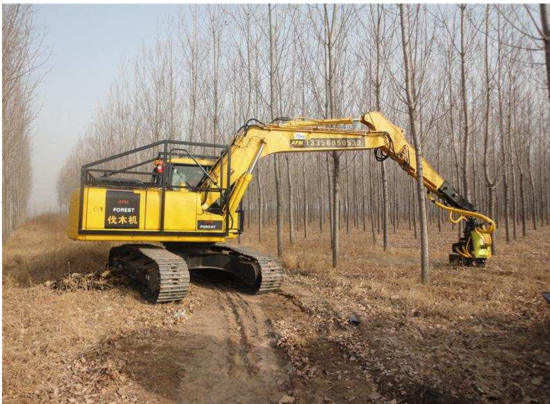
Picture 1: The imported head machine of Qingdao Tongrun was working in Qingdao China

In this thesis the Author has just mentioned the primary stage of the whole distributorship business. Due to the limitation of the conditions and opportunities, there is some extending interesting topics from this area cannot be studied here. If somebody interested about Chinese available harvesting forest, I would like to suggest studying the distribution of the available forests in China. It also can provide great suggestions and references for China harvesting machine business if the harvesting machine marketing development process in other countries be searched. Last but not the least, it should also help much, if somebody is interested to study customer's purchasing behavior in the harvesting machine business and products life cycle of harvest head machine.