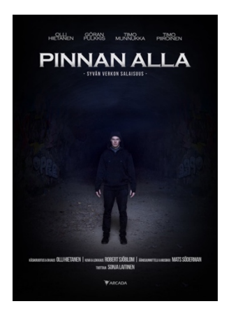
Figure 5. The Poster of Pinnan Alla