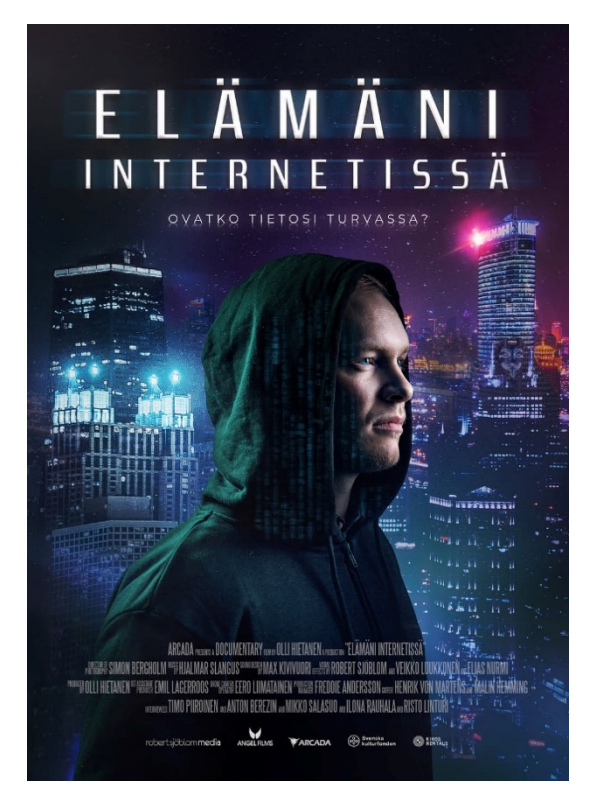
Figure 1. The Poster of Elämäni Internetissä