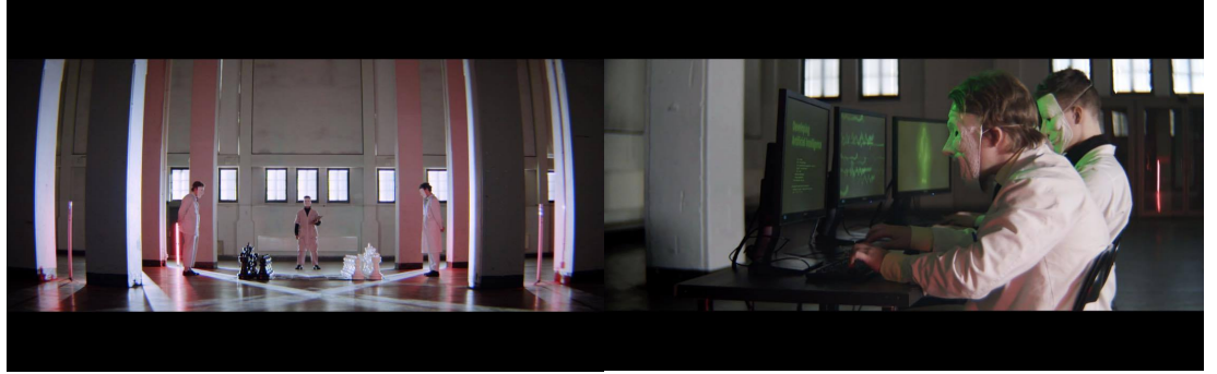
Figure 2. The scene of Chess

By creating approximately up to 8 minutes long three parts divided fiction stories. Of anonymous scientists in a chamber was to reflect fictionally upon the themes of the occurred within the interviews. The fiction is as well divided into Parts 1, 2, and 3 following by the interview parts. I reconstructed an ancient mythological belief of the Greeks gods of Moirais as well known in English as the " Fates " into my fictional scenes. Then I combine the Greek myth of the Moirais that decide the mortal individuals' faith by measuring the lengths of their threads to be cut with the topic of Individual data gathering. To be able to answer my research question to make a stand about a fact of truth about the future. Fictional transition scenes 1, 2, and 3: