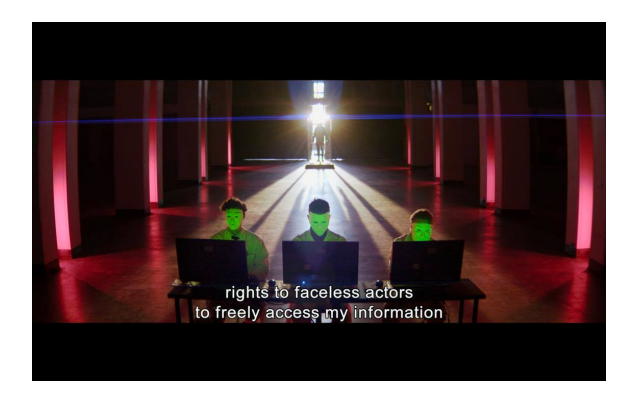
Figure 8. Elämäni Internetissä future fiction scene

"There is no principle of relative differentiation that could allow us to speak of any given composition as 'more' or 'less' fictive... and thereby assign it its proper place on the continuum. The distinction between natural and fictive is absolute" (Foley, 1986 p. 32). Aaltonen writes, the word "polyphonic" means a variety of "voices" simultaneous presence, dialog, and dialogue. They are not only the "voices" of the author and the characters of the film but also the various institutions of society. The documentary also includes the "voice" of the documentary, its own institution, and its own history (Aaltonen, 2006 p. 245). For Aaltonen, Nichols' modes have also proven problematic in many ways. They make it difficult to categorize Finnish diverse documentaries. Through renouncing the modes and genres, the authors are determined to represent the broad genre of the creative documentary (Aaltonen, 2006 p. 237).