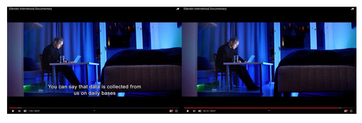
Figure 6. Elämäni Internetissä the Beginning and Ending shot at the reporters place

actually see the reporter walking around from place to place in the Elämäni Internetissä documentary without a hoodie. We don't break this fourth wall by addressing straightly the audience, as documentaries usually do with the help of reporters. Therefore, this whole documentary could be experienced as a fully fictional story, consisting of different worlds of the reporter (myself). So, in the notion of this idea as concluding and explaining the reporter's reality in my work: This whole research about individual data gathering has happened inside of the reporter's head over one night. The interviews presented in the documentary have taken place earlier before this current night wherefrom the story starts. The reporter as a character is summarizing his memories of these interviews as he researches more information about the topic of concern. He is exhausted from the amount of information and devastated about the hack that has occurred to him. Therefore, he starts to experience a sudden detachment from his body as presenting what is going to happen in the future with his data fully in fiction. Reporter's research has been taking place for a longer time and the breach info at the beginning of the documentary is raising a cause and a purpose for him to be the one who the story is getting presented through. As described in the Synopsis of Elämäni Internetissä documentary in chapter 4.