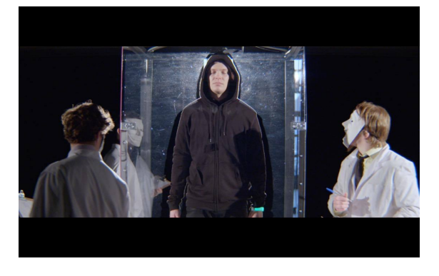
Figure 4. The scene of the Glass Box