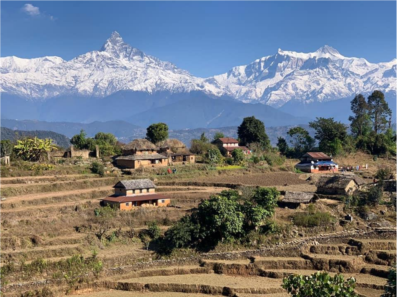
FIGURE 2. A typical rural village of Nepal. (adapted from Mountain View Homestay 2020)