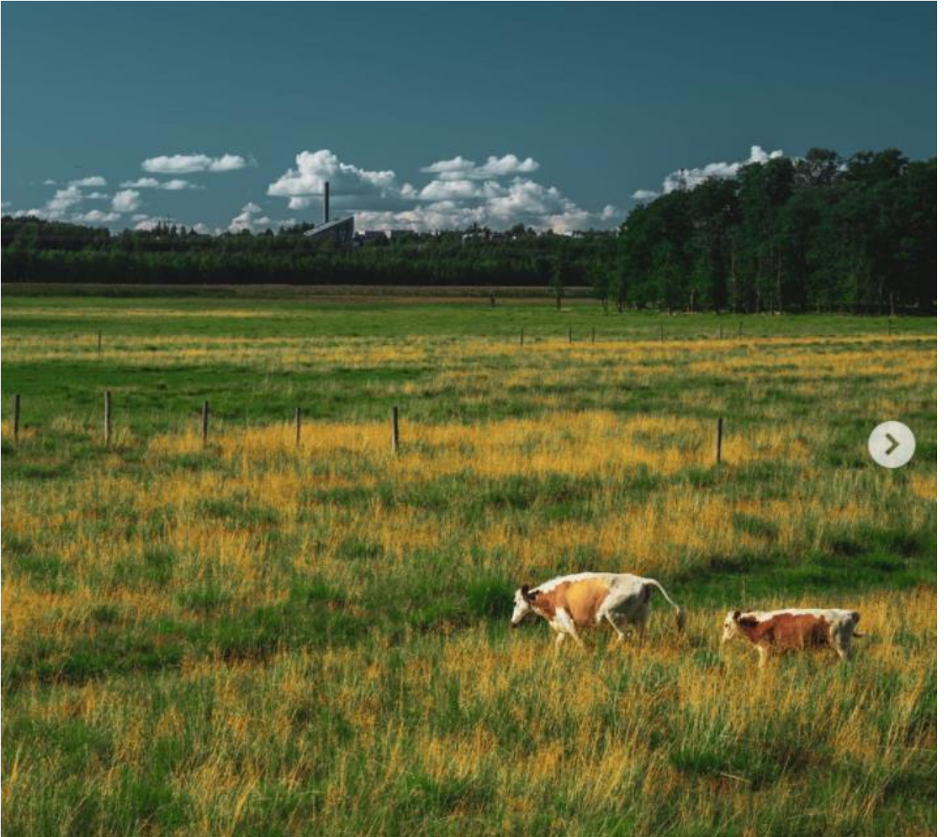
FIG 3. A farm in a typical Finnish rural area