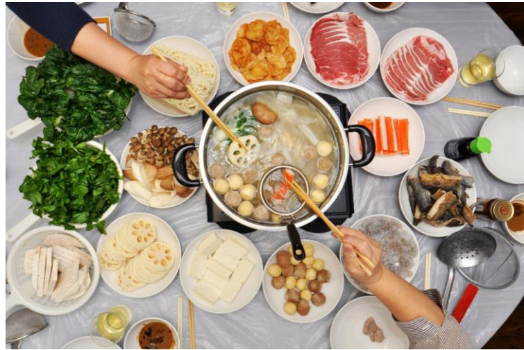
Figure 1 : Traditional Hot Pot (Liu 2015.)

Figure 1 illustrates the traditional hot pot style. Another factor which might contribute greatly in the success of the restaurant is the cold weather in Finland. Beside studying at school, the writer has been working part time in a sushi restaurant, and as the season changes, from summer to fall and winter in particular, the writer has been noticed the increase of the hot miso soup which were consumed by the customers. The fact that more and more customers consume hot soup everyday which gave the writer the thought of they would react the same with hot pot.