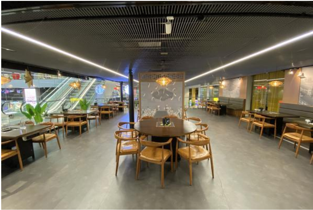
Figure 4: Brokadi's interior design