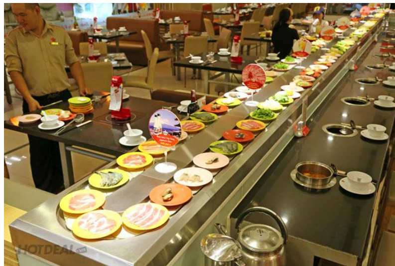
Figure 2: Conveyor Belt Hot Pot

Figure 1 illustrates the traditional hot pot style. Another factor which might contribute greatly in the success of the restaurant is the cold weather in Finland. Beside studying at school, the writer has been working part time in a sushi restaurant, and as the season changes, from summer to fall and winter in particular, the writer has been noticed the increase of the hot miso soup which were consumed by the customers. The fact that more and more customers consume hot soup everyday which gave the writer the thought of they would react the same with hot pot.