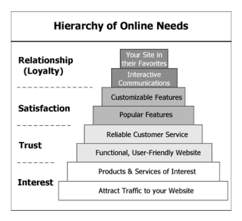
Figure 2. Hierarcy of Online Needs (Neuman 2007 p.30)

Neuman (2007 p. 29 f.) formed a variation of Maslow's pyramid that helps to understand how to meet online customer needs.