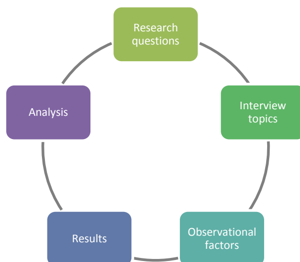
Figure 3. The process of the research.

Analysing qualitative research material is a two-step intertwined process: the material is classified and simplified, and the results are analysed. Simplification and classification aim to group the findings and forming them into cues based on which the analysis is drafted. Understanding findings is the key for analysing the qualitative research and understanding is achieved through interaction between the researcher, the theory and the findings. (Vilkka 2006, 81, 86-87) Figure 3 represents the process of the research in this thesis. In this chapter the interview answers and observational findings are represented and in chapter 7 the results are analysed based on the research questions.