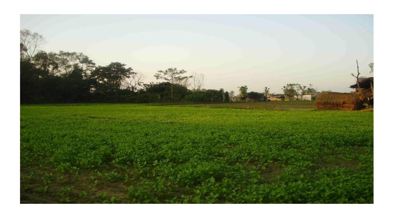
GRAPH 8. Mustard field in Sauraha, Chitwan

The mail crop of the Sauraha region is mustard cultivation. Mustard seed is used for cooking oil and other purpose. The Sauraha region is very good for mustard. They export the mustard oil to other districts as well. Tharu and forest are interred related to each other are after the malaria eradication, the hill people shift to Chitwan district, so the Tharus committee are minority in this region. (McLean, 1999.)