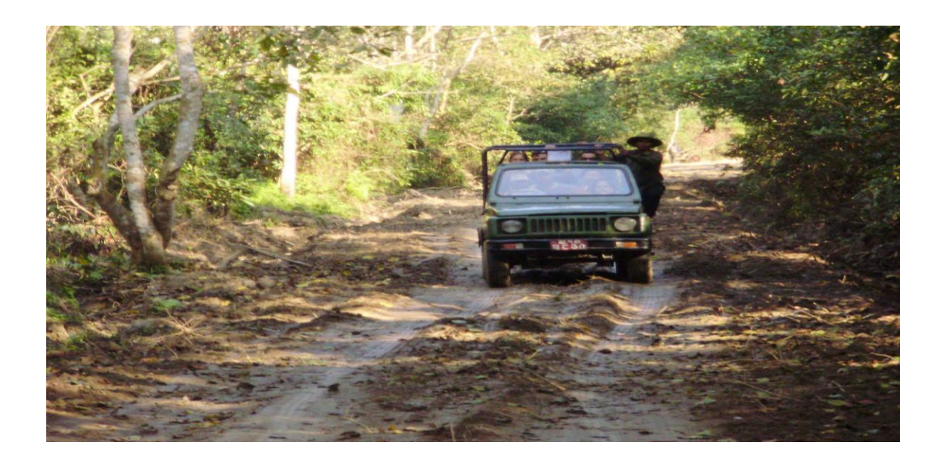
GRAPH 12. Jeep safari with tourist guide inside the Chitwan National Park.

In Sauraha, there are different kinds of employment generated from tourism industry. Some of them are tourists and nature guides. During field visit, the author received the information that there are 25 travel and tour offices in Sauraha. These travel and tour offices had 400 tourists and nature guides. Among them 40% are only Tharu tourists and nature guides and the rest of them are Hill migrants. The author also found out that most of the hotels and resorts also have one tourist and nature guide which help to visiting tourists especially from third world countries tourists.