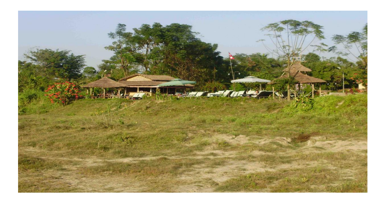
GRAPH 15. Restaurant in Sauraha near by bank of Rapti River

found that the Tharus are working as waiters, room boys, cooks, utensils washers etc. As the Tharus are not more educated and skillful than the hill migrants, the Tharus have been working in lower position with lower salaries.