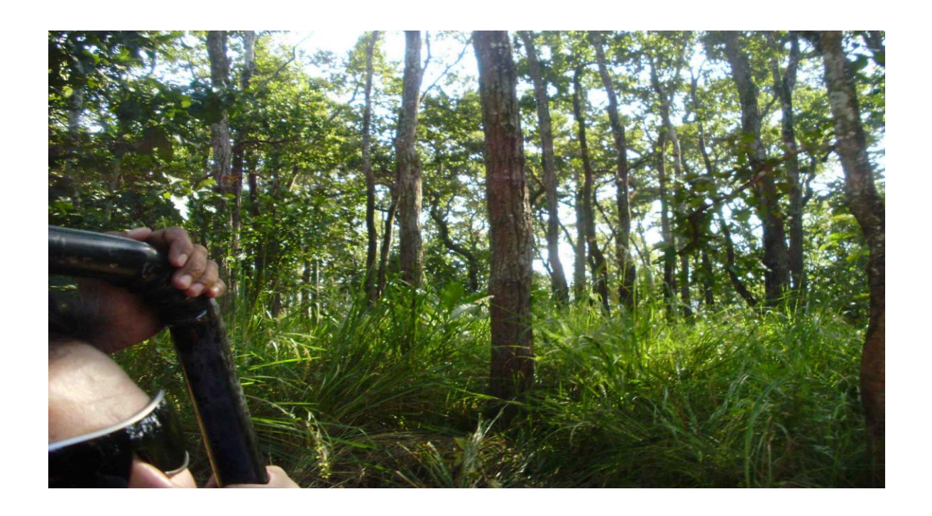
GRAPH 5. Sal Forest (Shorea robusta)

Dicotyledons, 137 Moncotyledons and 16 Orchids. The endangered floras are cylas tree and screw pine. (Nakarmi 2007, 19.)