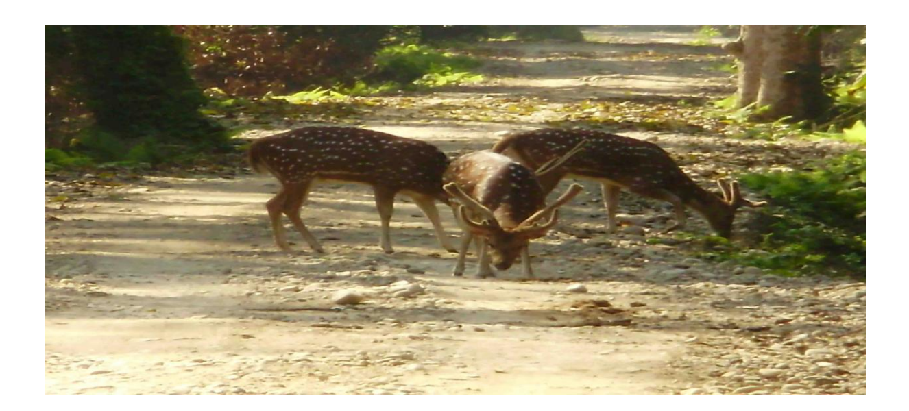
GRAPH 4. Chital (spotted deer) inside the Chitwan National Park

of the attractions in this national park. There is center amount for entrance fee to see this breeding center. (Ballouard & Cadi, 2005; DNPWC 2006.)