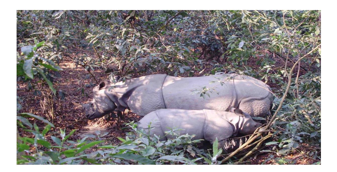
GRAPH 2. One horned rhinoceros

The main occupations of surrounding people are agriculture, tourism and trade. (Nepal Culture Travel & Tourism, 2011.) The indigenous and ethnic people such as Bote, Darai, Kumal and Tharu have been found in this area. Among them the Tharus have the larger population in the area. (Pilgrims 2007). The Chitwan National Park is the collection of flora and funa; there is lot of things to see. One time is not enough to see all the animals and plants. To see rare animals inside the national the visitors also to be luck. Different kinds of tourists come to see here. Some of them are animal expert, bird expert, forestry expert and some of them are natural lovers also. The main attractions of Chitwan National Parks are as follows: