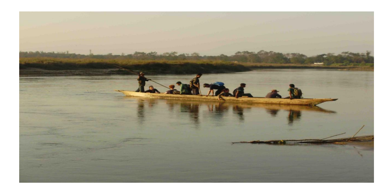
GRAPH 13. Canoeing on Rapti River

Oxcart is an interesting vehicle to use when visiting the village of Sauraha. Generally, third world countries tourists like to visit the village of Sauraha by oxcart. Most of the oxcart drivers are the Tharus.