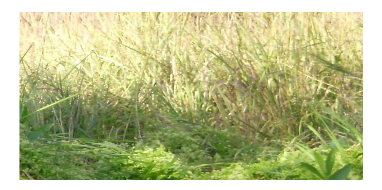
GRAPH 6. Grassland inside the Chitwan National Park

A total of 5520 ha of grassland is distributed in patch form in the Chitwan National Park. The greater parts are distributed in the central (3149.7 ha) and eastern (1309 ha) part of the park. In 1970 grassland covers 20% of the total national park area. Grass land is important food source for rhinoceros, elephants and different types of deer's. The grassland is home place for different kind of birds. To preserve the grassland area the national park has cut and uprooting the unnecessary other species from it. Every year in February and March the grassland has cut and burning. This makes good for new coming new grassland in the area. (Nakarmi 2007, 20; Chitwan National Park, 2011.)