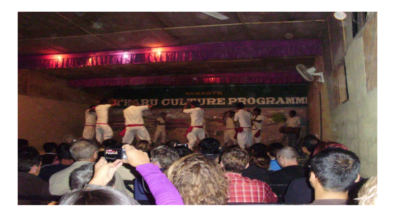
GRAPH 9. Culture programme shown by Tharus

Tiger Top Lodge, Gaida Life Camp, Machan Wild life Camp, Temple Tiger are inside the national park. They are high class hotels and resorts and others are in Sauraha, buffer zone area of the national park. The price of hotels and resorts are varying according to the stander of hotels and resorts. The Tharus has made some hotels and resorts in traditional way. As tourists want exotic and unique things, they like to sleep in the traditional type of hotels and resorts. Some Tharus have also share room for tourist as a lodge. They will also cook traditional food for them. They get friendly environment in this type house. In above table, some famous hotels and resorts are only shown. Tourism business has been generating employment in Sauraha which directly and indirectly benefited the local people. (Wapanepal 2010.) The tourism attractions in Sauraha are as follows: