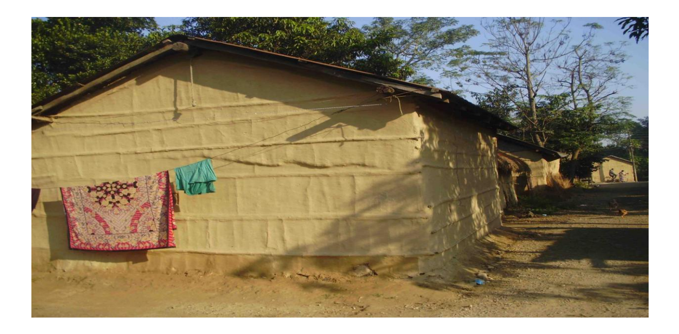
GRAPH 7. Typical the Tharus house in Sauraha, Chitwan

According to Nepal census of 2001, the total number of population of the Tharus is 1,533,879 in which the percentage is 6.75% of total population of Nepal and 5.86% people speak the Tharus language of total population of Nepal. They are living at the edge of the forest, farming and rising livestock on the plains. They depends on river and forest products such hunting animals in the forest for meat collecting, fruits roots, herbs and fish. Their main food is rice with fish. Other foods are chicken, pork, rabbit, pigeon, tortoise as well as Dahl and vegetables. Women make homemade alcohol from wheat and barley. (CBS 2001.)