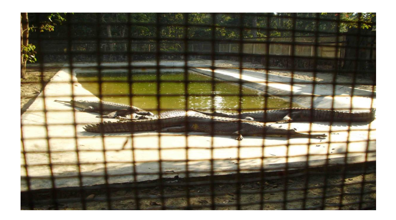
GRAPH 3. Crocodile (Ghariyal) breeding center inside the Chitwan National Park

valuable horn. The price of horn is very expensive in international market. In 1960, the numbers of rhinoceros was dropped into 100. In 1988, the number of rhinoceros ware 358 and in 2000 were 612. As per DNPWC report, there were 504 rhinoceros in 2010 inside Chitwan National Park. All over the Nepal there were altogether 534 rhinoceros in 2010. The food for rhinoceros is grass species. Rhino lives in sub- tropical climate with alluvial flood-plain where green grass is available all over the year. (WWF 2011; DNPWC 2010.)