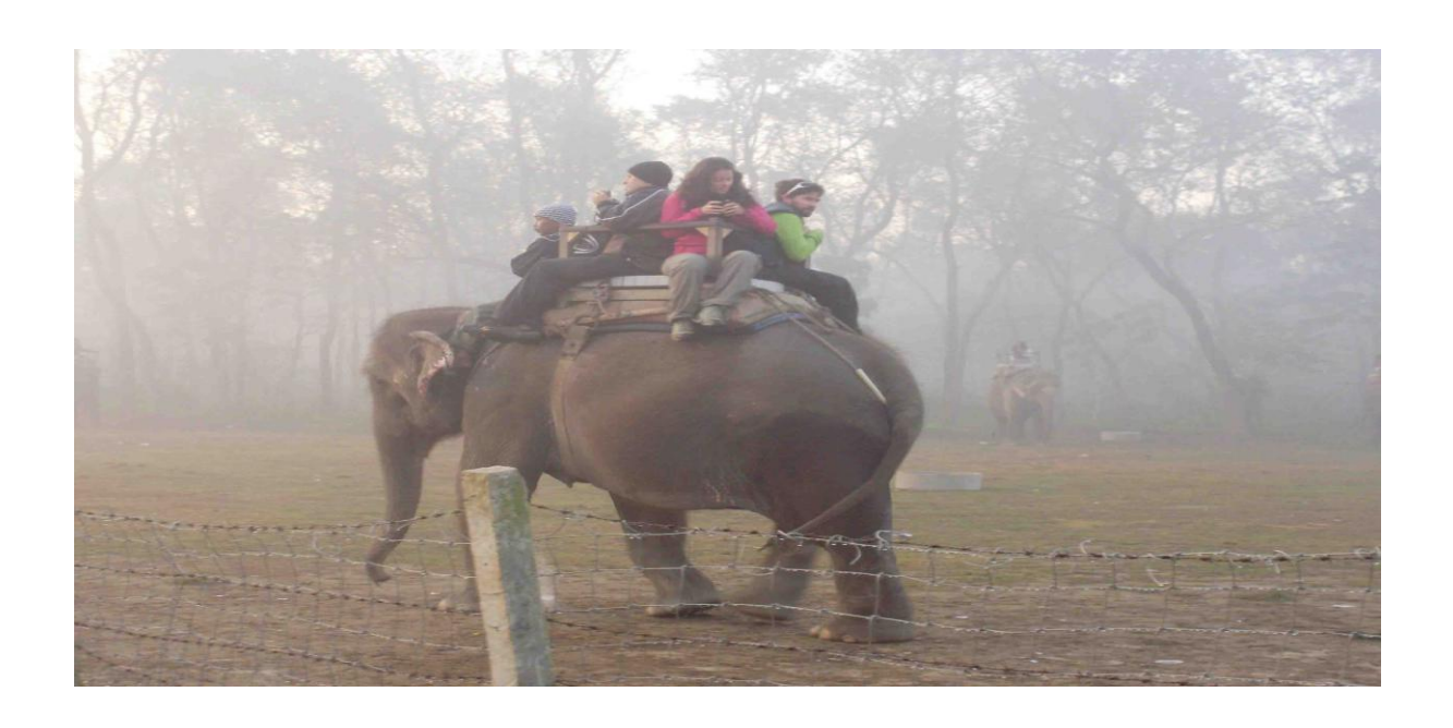
GRAPH 14. Jungle safari with elephant riding in the buffer zone community forest

The elephant riding is also one of the major activities in the Sauraha. Tourists are interested for jungle safari and they visited in the buffer zone community forestry with elephant riding. In the Sauraha, there are 65 elephants which are the owned by the private sector. These elephant riding services are provided with the elephant cooperative center on syndicate system. The elephant riders are Indian people, some are Bote, Kumal and some are Tharu and others are from eastern part of Terai region of Nepal.