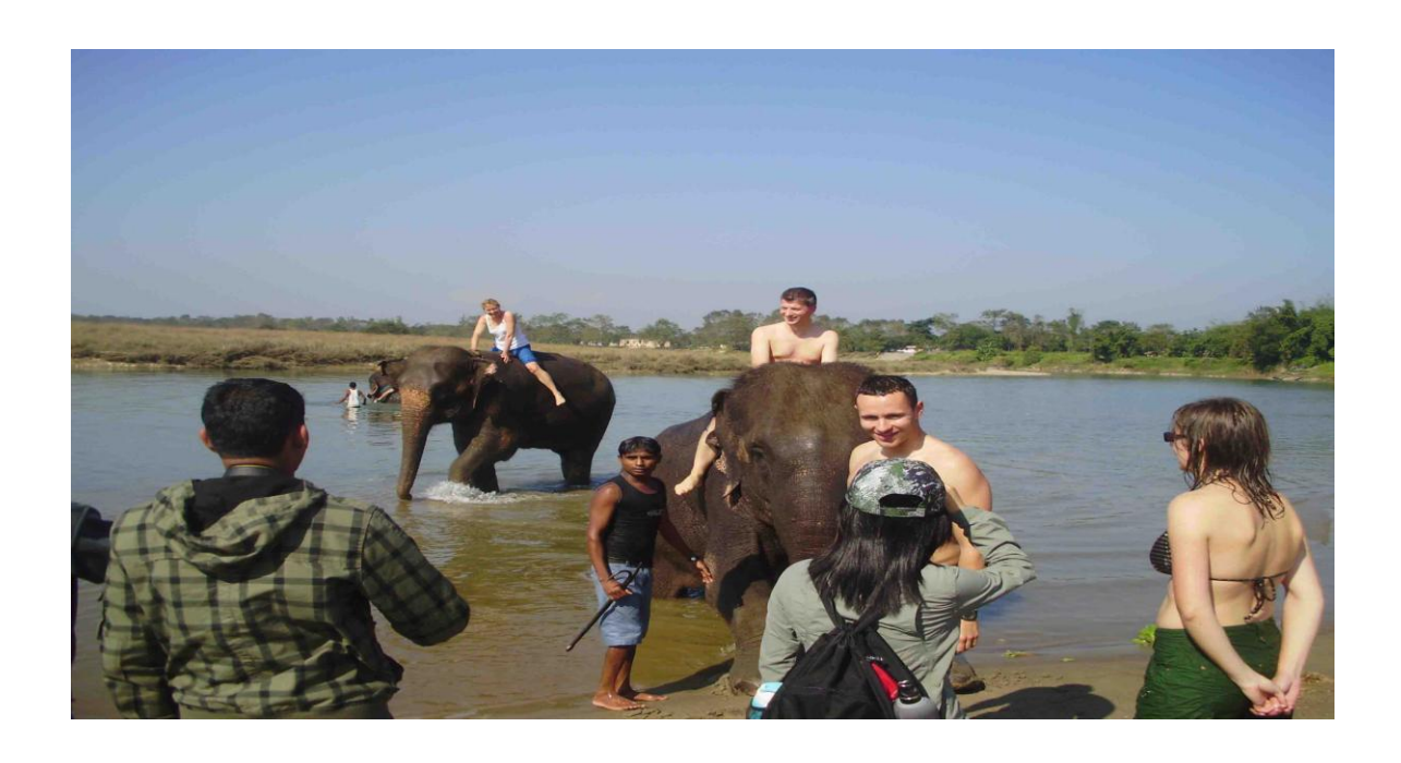
GRAPH 10. Elephant bath in Rapti River near Sauraha

In warm days the tourists get much entertainment from elephant baths. The elephant sucks the water from the river and sprays the water at visitor. The elephant rider shows different kinds of water spot activities from the back of the elephant.