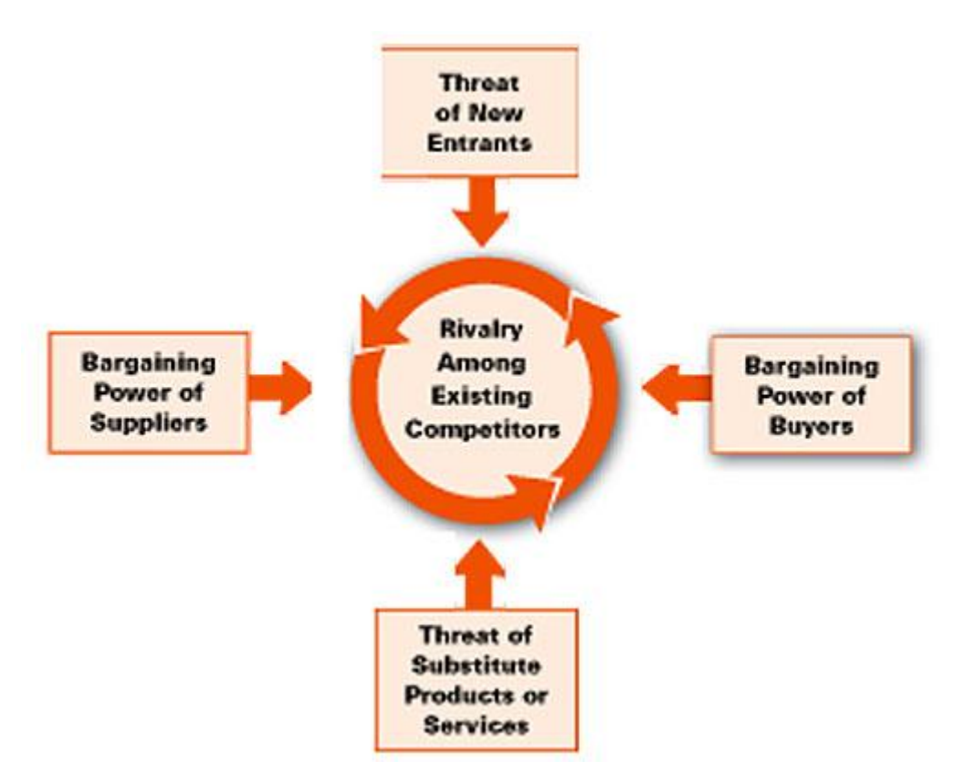
FIGURE1. Porter's Five Forces (Porter, M. 2008. Date of retrieval 9.5.2012)