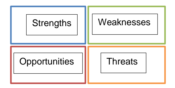
FIGURE 2, SWOT analysis

SWOT analysis could be also defined as "a scan of the internal and external environment is an important part of the strategic planning process. Environmental factors internal to the firm usually can be classified as strengths ( S ) or weaknesses ( W ), and those external to the firm can be classified as opportunities ( O ) or threats ( T ). Such an analysis of the strategic environment is referred to as a SWOT analysis ." (QuickMBA, 2012, Date of retrieval 8.3.2012)