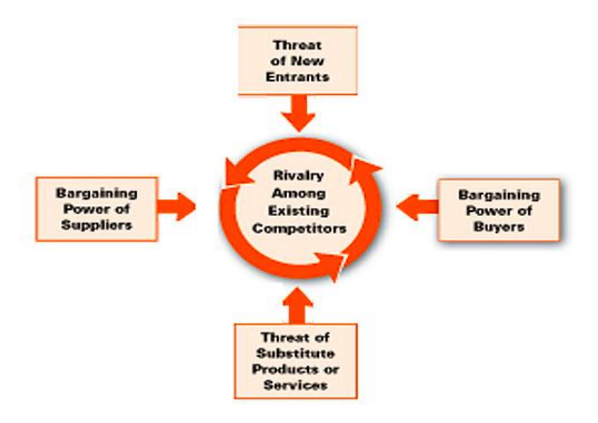
FIGURE 4. The Five Competitive Forces (Kotler and Keller 2009, 335)