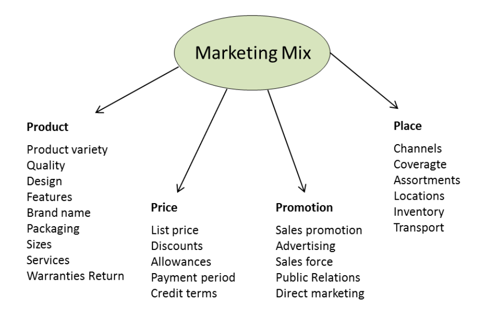
FIGURE 5. The Four P Components of the Marketing Mix

The marketing mix tools are categorized under four broad concepts called the 4 Ps of marketing: product, price, place and promotion. With these concepts, the company is able to plan and guide its marketing activities and most importantly to "create, communicate and deliver value for consumers". (Kotler and Keller 2009, 62)