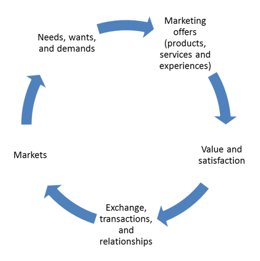
FIGURE 1. Core marketing concepts

Marketing and strategic planning go hand-in-hand in a company. Marketing provides vital information needed for strategic planning. The strategic planning defines and guides marketing in the company. Formal planning benefits all companies and encourages systematic thinking. Through planning the company is able to set objectives and policies and create efficient coordination of tasks inside the company. The continuous stages of the planning process can be seen from Figure 2. (Kotler et al 2005, 49-50)