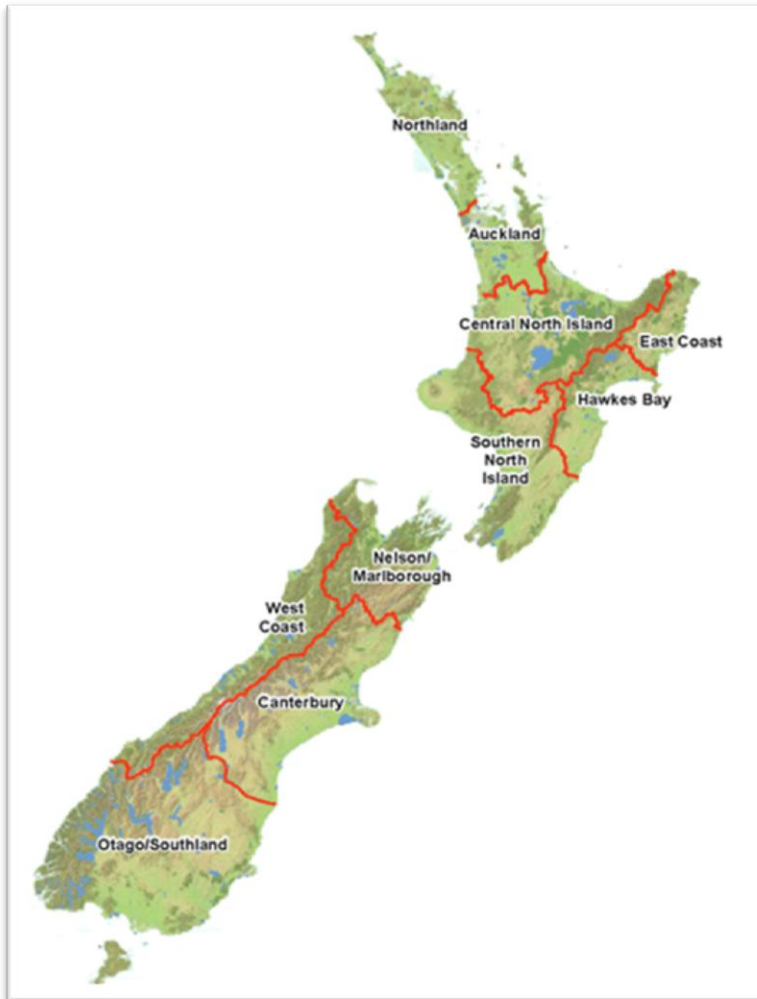
FIGURE 2. New Zealand Wood Supply Regions (NewZealand.Govt.nz, 2012)