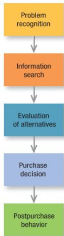
Figure 2. The five-stage model of consumer buying decision making process (Kotler & Keller, 2016)

As Kotler & Keller's (2016) five-stage model of buying decision making processes have been discussed extensively in chapter 3.3 it is worthy to mention that processes have also been included in other marketing research. The famous "marketing mix" of four Ps have later been extended to include physical evidence, people and processes. Though, next chapter will focus on the original four Ps – product, price, place and promotion – as the key component of any marketing environment.