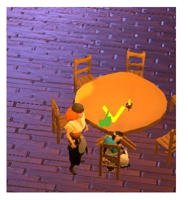
Figure 10 satisfied customer