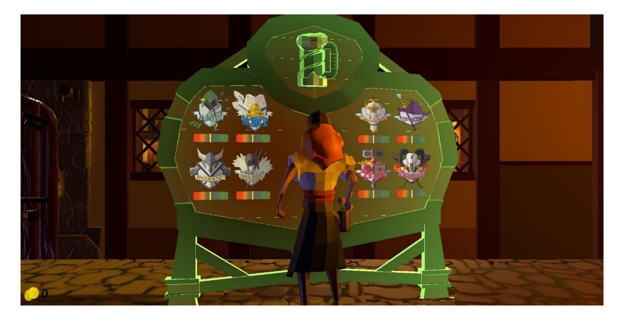
Figure 9 Reputation Board

said faction will visit the tavern. For example, if the players standing with the peasants is bad, they might not visit the tavern at all and thus making it harder to reach the daily quota.