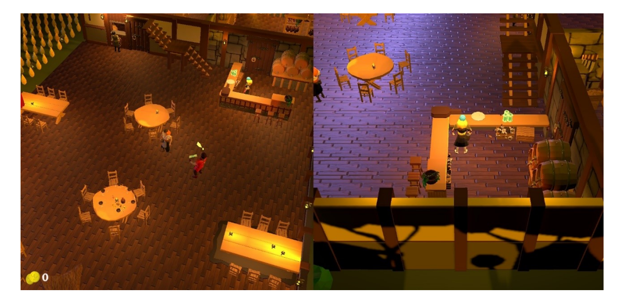
Figure 7 Split screen mode in Behind the Tankard

In figure 7 is a demonstration of the split screen feature. "Player one" controls the left screen, and "player two" controls the right screen. All the assets used are made by the team utilizing Maya3d and Blender that are then imported into Unity3d. These "modes" can be switched back by pressing f2 key. This causes the other playable character to disappear and the screen going back to one player view only.