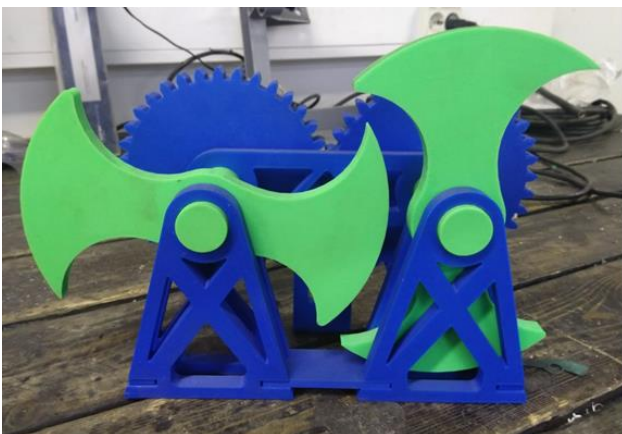
Figure 1. 3D-printed Proof of Concept

The result of the project was a fully functional device that met the client's requirements (see Figures 1 and 2), i.e. the goals of the project were totally achieved. The project team worked as a team systematically and learned many new things in several different sub-areas of product design. Project team describes that the best moment of the project was the completion of the prototype, as well as its initial tests. All the work crystallized into the moment when everyone could see the imprint of their own hands, as well as the realization of common visions and goals. (Heinonen, et al. 2020).