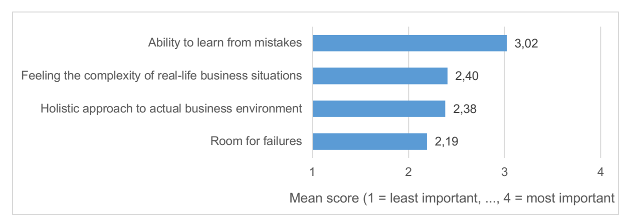
Figure 1. Ranking of variables related to the importance of being part of digital game-based learning.

Friedman test indicates that the rankings have statistically significant differences ( \chi^2 = 10.991, Sig = 0.012). Based on the Wilcoxon Signed Ranks Test, the ranking of 'Ability to learn from mistakes' is statistically significant from the other given variables (Sig. 0.000-0.022, Table 3).