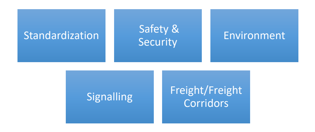
Figure 2: Organization X vital action points (Organization X 2021)

Organization X is one of the partners of the SAFETY4RAILS project. The mission of Organization X is to support railway transport in the development of a more sustainable and resilient environment. Also, enhance international cooperation and best approaches among associates; increase information sharing on railway operations and systems; and suggest innovative actions to promote cost-effective solutions. Organization X, as listed in figure 2, has established five action points in which it will be focusing on to act and serve its worldwide associates' operational needs (Organization X 2021):