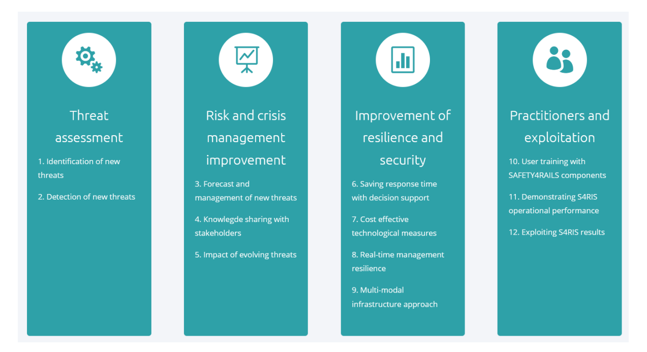
Figure 1: SAFETY4RAILS goals (SAFETY4RAILS 2021)

SAFETY4RAILS goals, as shown in Figure1 below, are focused on outcomes englobing threat assessment to assist in identify and detect new risks targenting railway infrastructure, improving risk management and crisis forecast, strengthen resilience, promoting overall security improvements in railway network operations and familiarizing practitioners with SAFETY4RAILS information system.