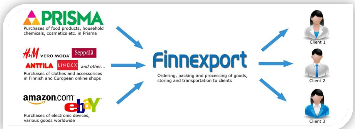
GRAPH 3. Supply chain of Finnexport company

Clients can also order via us goods from world-famous online auctions and online shops such as eBay and Amazon. It is well known that some goods on eBay cost less than same goods in ordinary shops. Delivery to Russia is not available on eBay though due to issues with Post of Russia. I believe they will start delivery some day, but at the moment many Russians have to look for mediators in other countries who can order product from eBay and send it to Russia. Of course mediator gains some interest from this, especially if he is able to purchase goods on auction with reasonable prices. Sometimes they use special software, which monitors bids and at the very end of an auction programme puts a little bit higher bid, and opponents have only 8 seconds to increase a bid, other way they lose. There is possibility to set bids limits in the programme, i.e. it won't increase bid higher than certain amount of money set by mediator.