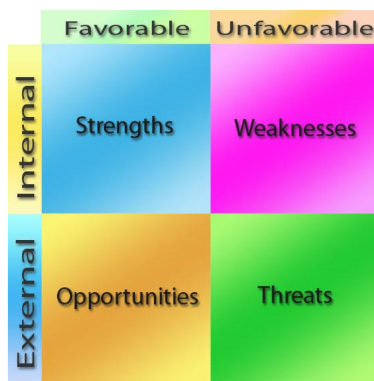
GRAPH 2. SWOT analysis example chart

Analyzers need to ask and answer important questions and find most appropriate information for each question. This will help to benefit of the analysis and find the most reasonable objective. I drove a graph in Photoshop to show how SWOT matrix is constructed. Strengths and weaknesses belong to internal factors, which reflect business's or project's condition at the moment and can be influenced by analyzer. Opportunities and threats belong to external factors, so project manager or businessman can not affect them, but s/he can take into account them and correct project's or business's objectives and strategy. Normally, the SWOT analysis is presented as a graph or table layout for more convenient analysis and graph 2 is the example of that.