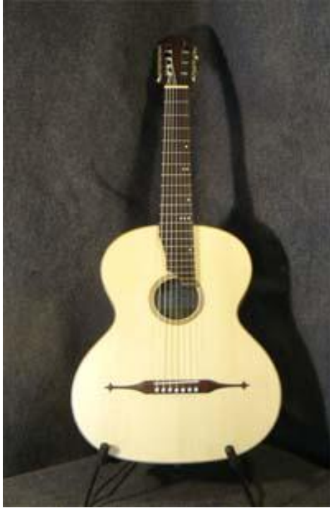
The seven-string guitar