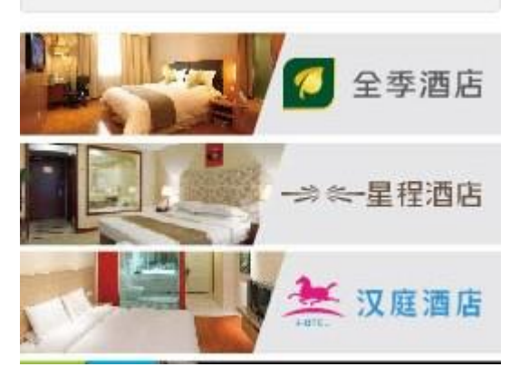
Figure 2: Room types.

Website only has two or three hotel room pictures display, and they are extremely common, cannot achieve any publicity. As it presents below, there are only three room types on the website, it is obviously that latest website construction would be a long time ago.