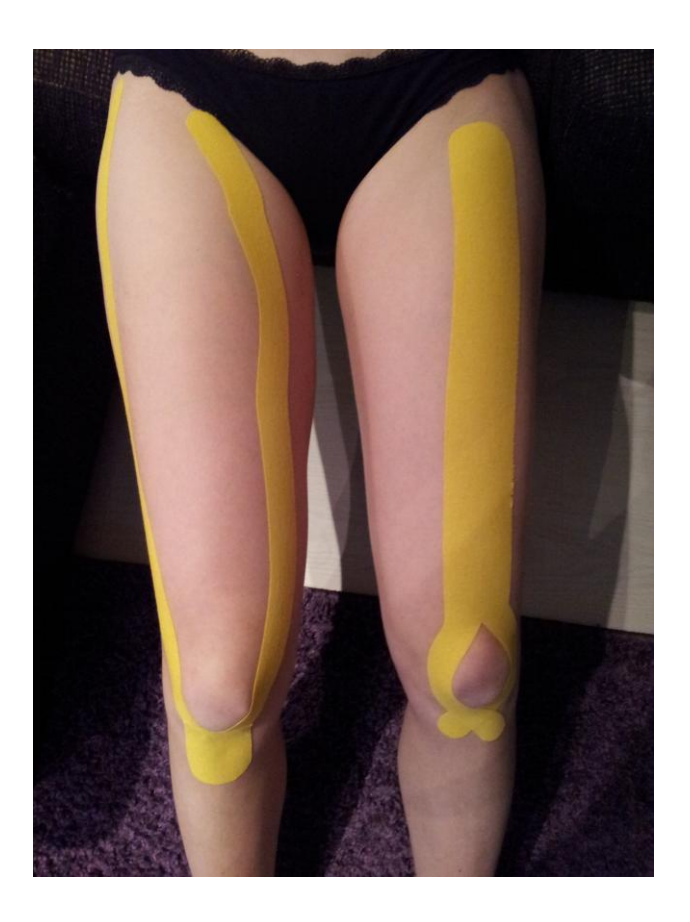
Fig. 2 Tapings to inhibit (right thigh) and facilitate (left thigh) the quadriceps muscle done similarly to the study from Vercelli et al that was included in the review.