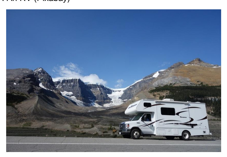
Picture7. An RV

The biggest option for road trips is caravan trailer/towable RVs. To be able to travel around with a trailer you need to have a strong enough car that can pull it around. Caravan trailer is good for people that are staying in the same area for a longer time since you