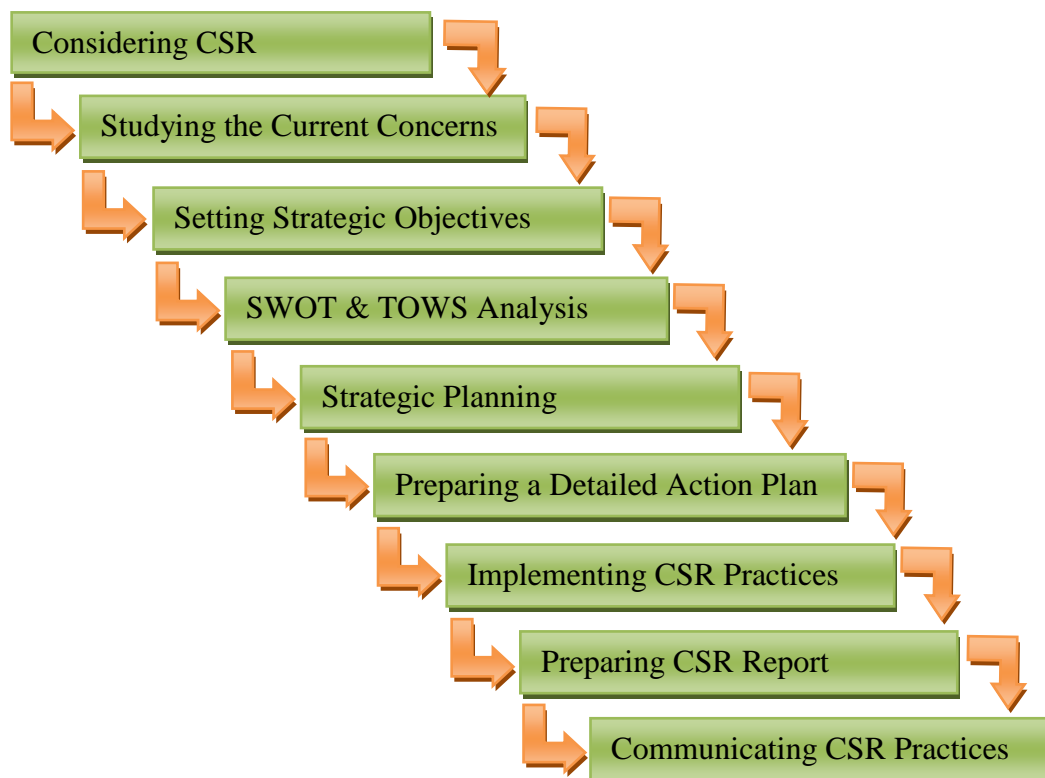
Figure 3. Action Plan

Finally, a properly-structured CSR report is recommended to be prepared. In its CSR report, Lapland UAS discusses the addressed concerns, the motivation to choose specific concerns to be addressed and the results. Following preparation of CSR report, an appropriate channel is needed to be determined for the purpose of interactively communicating the practiced CSR activities. Figure 3 illustrates the action plan in a frame.