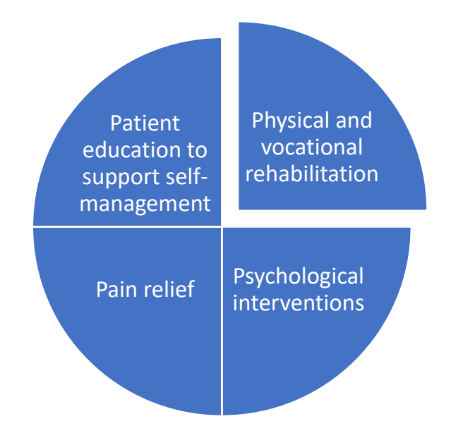
Figure 1. Four pillars of treatment (Modified from Goebel et al. 2018, 4).

The second edition of the UK guideline for Complex Regional Pain Syndrome in Adults for diagnosis, referral, and management of CRPS in primary and secondary care states that treatment approach of a client with CRPS should be interdisciplinary and cover four pillars which are: physical and vocational rehabilitation, psychological interventions, patient education to support self- management, and pain relief (see figure 1). To provide the best practice the physiotherapist should: recognize the clinical signs of CRPS and know the Budapest criteria, aim in early start of the treatment, give patient education about the syndrome, know where to refer the client for pain or CRPS specialized rehabilitation, and identify the non-resolving moderate or severe symptoms, and when possible, refer the client to a pain or CRPS specialized centre. (Goebel et al. 2018, 3-4, 12.)