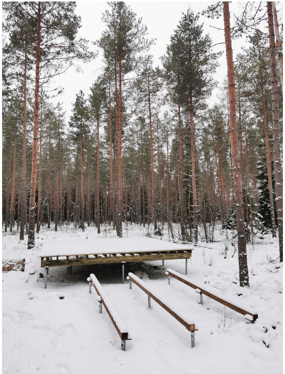
Figure 3: The site for the measurement station in a peatland forest that is to be restored in Tammela, southern Finland.

Pöyry (2020). Study on the development of peat energy use in Finland. Pöyry Management