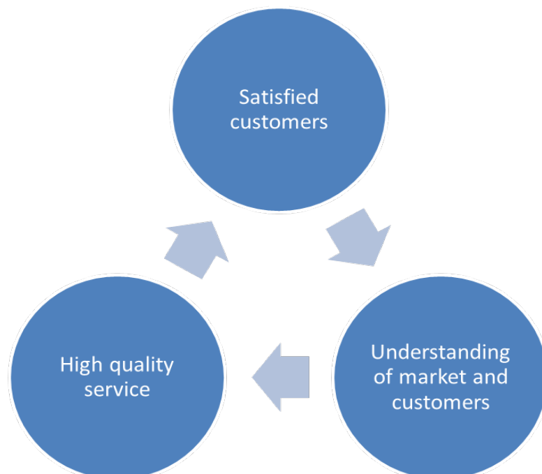
FIGURE 2. Total Quality Management (Lecklin, 1997, 19). Modified.

Quality can be achieved by understanding the customers and the market. Better understanding of customers and the market provides information that can be used for high quality customer service. Company processes need to increase the desired quality of service, thus attracting and creating satisfied customers (FIGURE 2). When done right, quality management creates competitive advantage. However, customer satisfaction cannot be the only target, as maximized customer satisfaction can decrease the business' profitability in the long run. (Lecklin, 1997, 18.)