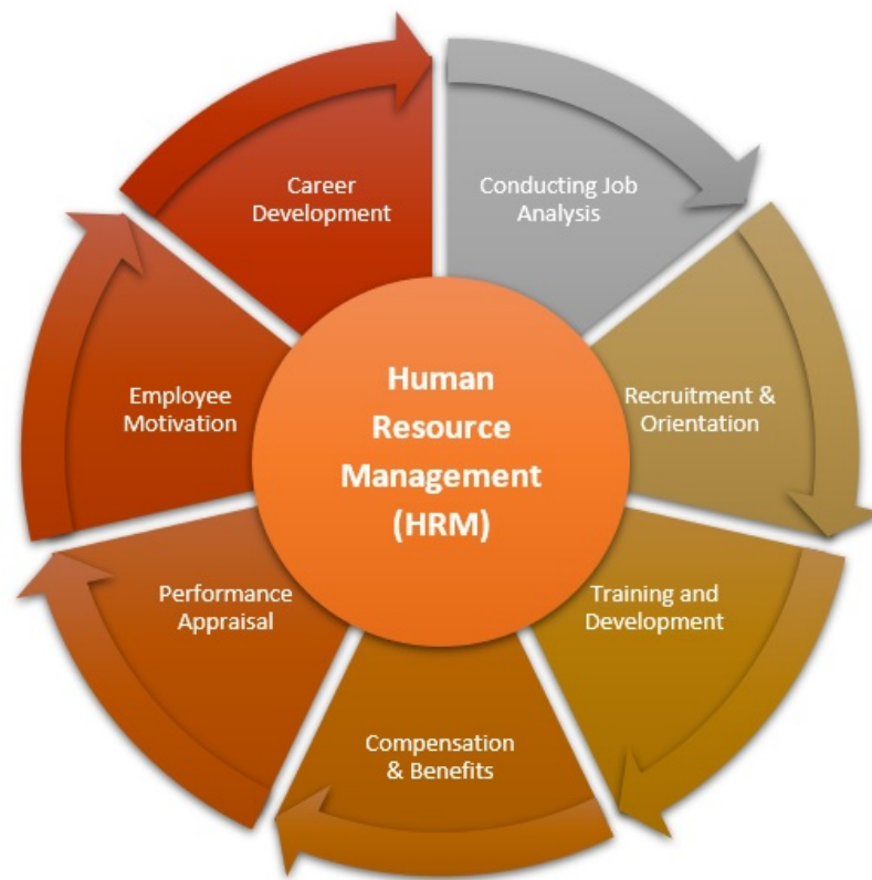
FIGURE 2. Human Resource Management (HRM) Meaning & Importance (HR Helpboard 2022)