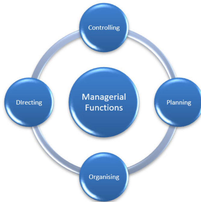
FIGURE 1. Functions of enterprise management (SmartSuite Staff 2021)