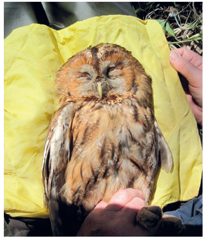
A reddish brown male tawny owl taking a nap in the sun while being ringed and measured.