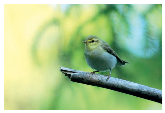
Many bird species preferring mature forest habitat types are declining at an accelerating pace in southern Finland. One of the species of large concern is the Wood Warbler ( Phylloscopus sibilatrix ).

Below are brief descriptions about the progress of their work.