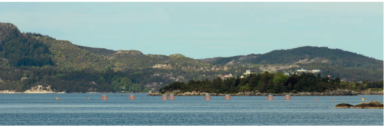
Mesocosms deployed in Raunefjord off Bergen, Norway.