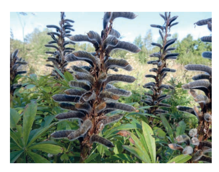
Cutting the flower stalks off before the seeds disperse is essential for controlling the invasive Lupinus polyphyllus .

Vi undersöker hur invasiva växtarters karakteristiska egenskaper tillsammans med omgivningsfaktorer påverkar sannolikheten för att en permanent invasion skall ske. Vi undersöker samtidigt hur rumslig och tidsmässig variation driver växternas populationsdynamik.