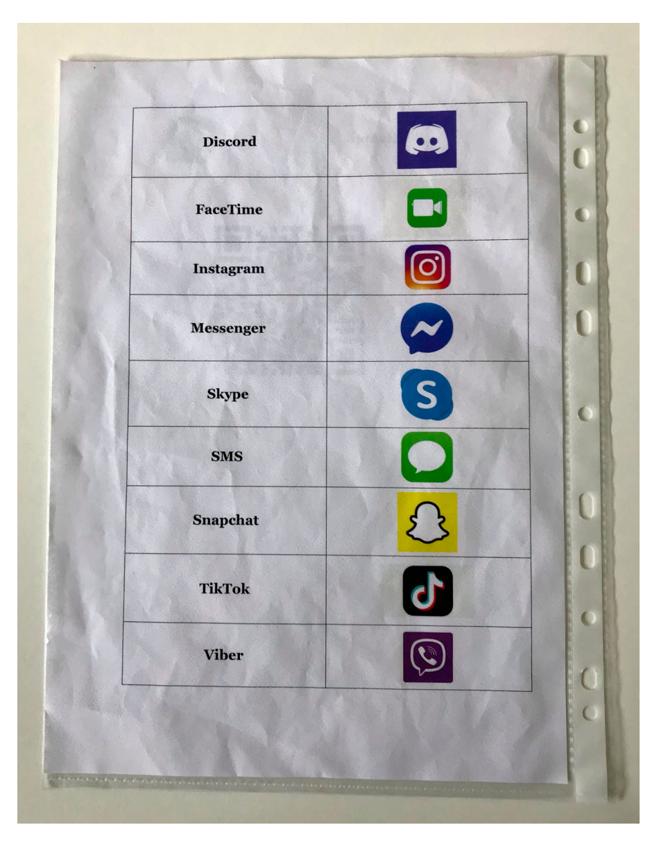
Figure 2. The paper sheet with app icons that the researcher used to engage children in the research.

This sheet turned out to be a true ice-breaker. In the field notes from one visit, the researcher wrote: