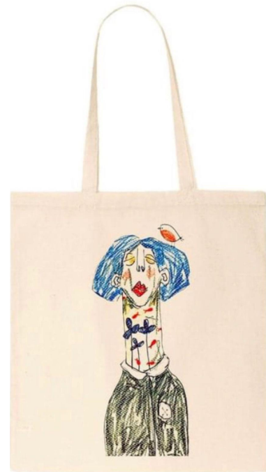
Image 7. Last version of the tote bag

After finishing the project Kuvittajat contacted me and asked me to print one of my illustrations which were in my portfolio in their magazine and put it on their social media (image 8).