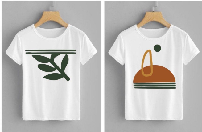
Image 4. First designs 1