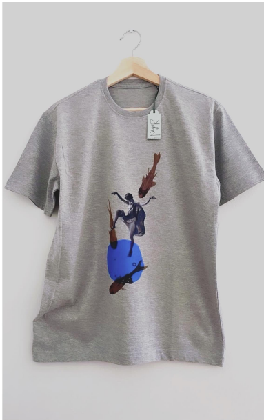
Image 6. Last version of T-shirt designing