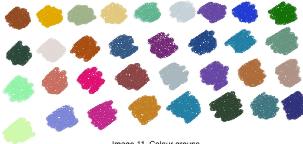
Image 11. Colour groups

I made a questionnaire for the colors that I want to use in my illustration to give a more spring vibe also in a meeting context. I showed those four different color groups to people and wrote down which one they used and based on their opinion I chose my color group. I had to change some color groups to have all the colors related to each other. You can see the color groups and the chosen one below.