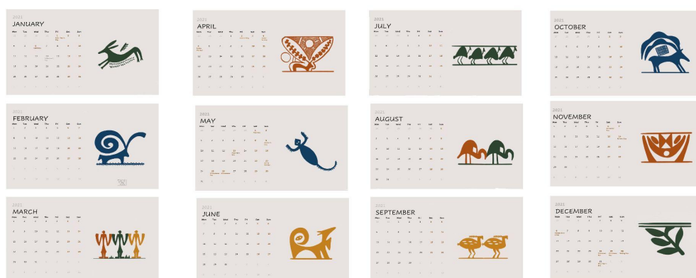
Image 3. Calendar designed by me, using a collection pieces of ancient pottery