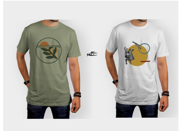
Image 5. First designs 2