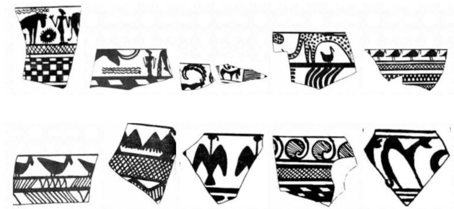
Image 2. Pieces of ancient pottery founded in Sialk Hill

for my calendar project because I always would love to bring something from the art of my country and mix it with Finnish art, something not so symbolic and traditional but something that we know where it comes from (Image 3).