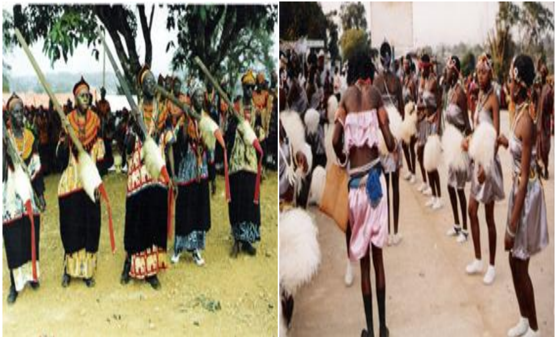
GRAPH 7 The Fon's spear and young girls dancing Lela adapted from ( balinyonga.org/linkspages/fonpalace.html )

to their best saying goodbye to Lela this year and see you again next year. The Fon also gives out the calendar of the next Lela in the future. The sticks decorated with red and white in graph 7 below is called the Fon's spear and any time the Fon wants to make announcement, this sticks must be present. Even if the Fon is sending his ministers for an era, those spears must be taken along. It is during this festival that the Fon chooses whoever he wants to have as a wife and nobody challenge him by saying " I will not marry you". Men really invite their daughters to this dance praying for luck to shine on him so that his daughter can be chosen as the Fon's wife since he, the father to the girl will have a title in the land and his respect will be increased among the villagers.