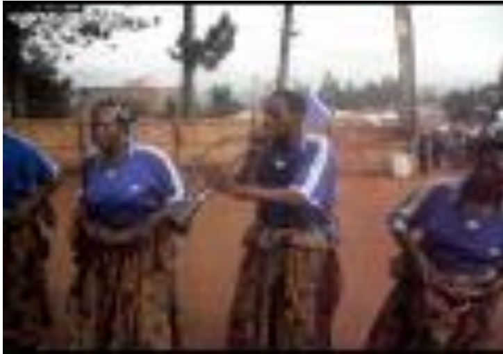
GRAPH 9 medumba festival dance adapted from ( https://www.youtube.com/watch?v=SvVdbH-HqaE )