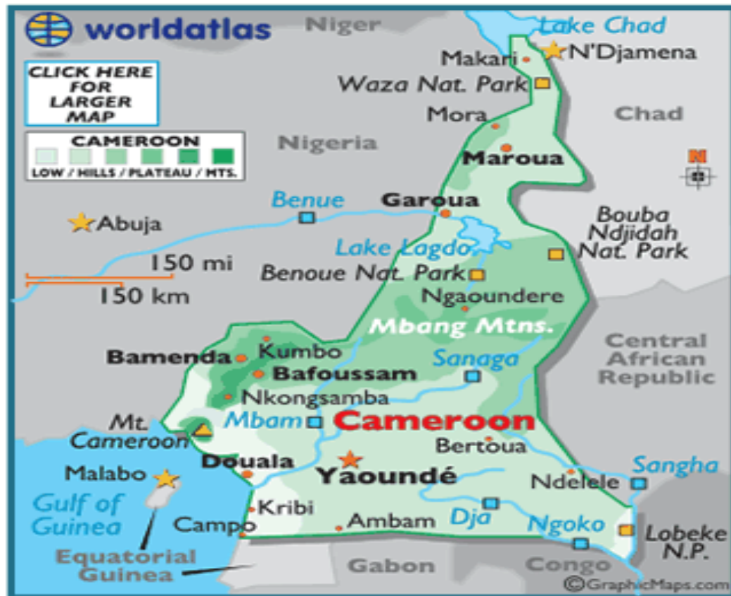
GRAPH 1 THE MAP OF CAMEROON adapted from ( www.worldatlas.com › Africa )

Cameroon is a country located on the West of Central Africa Republic. Cameroon is a bilingual country with French and English as its official languages. This country is divided into ten different regions and each region has a governor as the leader of the region.