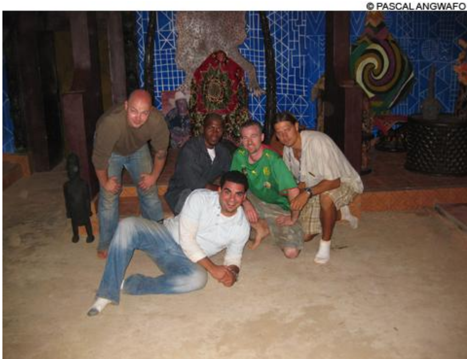
GRAPH 10 TOURISTS IN MANKON PALACE adapted from ( www.tripadvisor.com › ... › Bamenda ›)