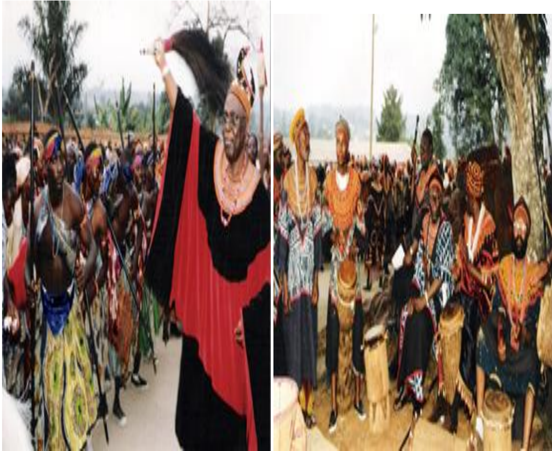
GRAPH 6 The Fon of Bali greeting its people during Lela dance adapted from ( balinyonga.org/linkspages/fonpalace.html )

Graph 6 above shows the Fon of Bali Nyonga dancing and greeting his people. He does not shake hands with anybody as culture demands; he does that by waving his hand. In responds the population will be shouting in appreciation with words like” you are more than a Fon, just seeing you I can sleep without eating but I will not feel hungry, you do not bath but you are clean all the time, I can never be tire of seeing you”. While they are saying all these, the Fon will then be making his ambianc with shoulder high up.