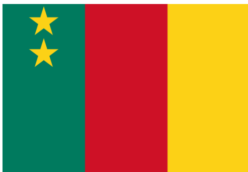
Flag before independence