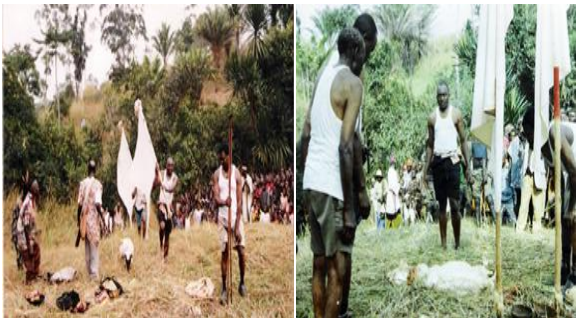
GRAPH 4 Lela ritual adapted from ( balinyonga.org/links/pages/fonpalace.html )

In Muganka dialect, day 1 of this Lela festival is called “shuh’fuh” which can be translated as washing the traditional rituals. It usually begins in the mornings, the two traditional flags “tutuwan” are taken out of the fon’s palace and placed in the Lela piazza. In the afternoon, usually at 1pm the general public comes together at the Lela arena to start the two mile journey led by the tutuwan to the sacred stream (shrine) called “nchi shuh fuh” meaning the shrine where the traditional ritual of a ram to be killed and offered to the gods is going to be performed. At this shrine the two flags that is tutuwans are immersed in the water for purification and asking gods to be on their side if there should be any war or intruders and then the flags are emerged out of the water if the flags are clean and dried, it signifies that the Lela festival will be a better one but if the flag should come out dirty and wet, it is a bad signal. The general public is very happy when the tutuwans are cleaned and dried as on their way back to the Lela piazza; war songs are chanted signifying they are ready for any attack from their enemies. Local made bow and arrows can be seen shot in the air while chanting the songs and they do this shooting of bow and arrow by running from the shrine until they will reach kah manfon’s (queen mother) residence for refreshment. The general public will then proceed to the Lela piazza with heavy gun firing followed by dancing until about 6.30pm.