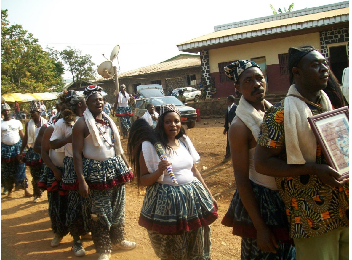
GRAPH 8 The researcher's own photo, ready for menghum dance.

This costume as seen above is made up of a traditional cap, a white top and a heavy cloth material which weighs about 4 to 5kg which is tied around the waist line with overlapping edges being well gathered, the rest of the material is long in between the legs, rattles are tied on the two legs which weighs about 3 kg. Shoes for this dance must be tennis shoes, a white towel to wipe away sweat, and a decorative hand tail of a cow is optional. The weight of this costume was the reason why most villagers believe only men and only adult age men could dance menghum because a lot of energy is needed to perform this dance. They were proven wrong by the writer of this thesis who is a woman. But in reality this dance needs much energy to twist the waist line so that overlapping gathered edges of the costume can open like an umbrella while dancing. The leg has about 3kg of weight, the waist line has about 4 to 5kgs and then performing this dance with all this weight is not easy. That is the reason while the writer of this thesis is called "Iron lady" in her community. This dance is one of the crowd pulling dance in the northwest