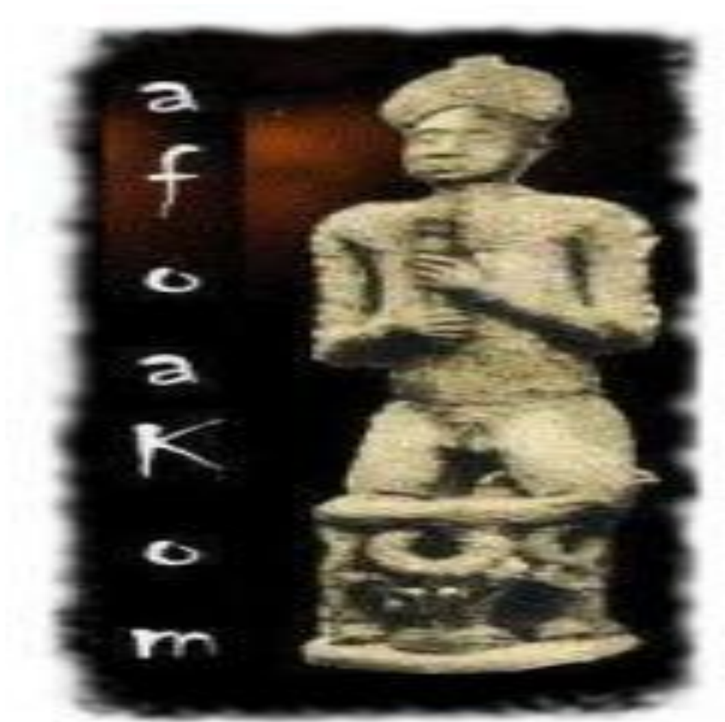
GRAPH 11 The statue of Afua-kom GRAPH 11 AFUA-AKOM STATUE