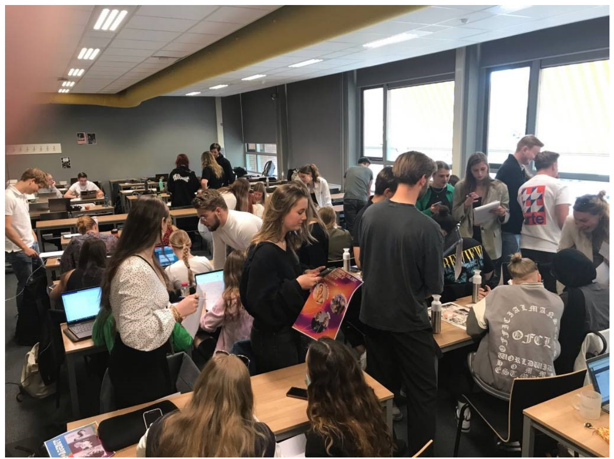
The students in the booking workshop were eager to learn about the music industry.

Pocus" by Focus and Shocking Blue's biggest hit, "Venus." It is important to understand the history of pop/rock music to understand its future.